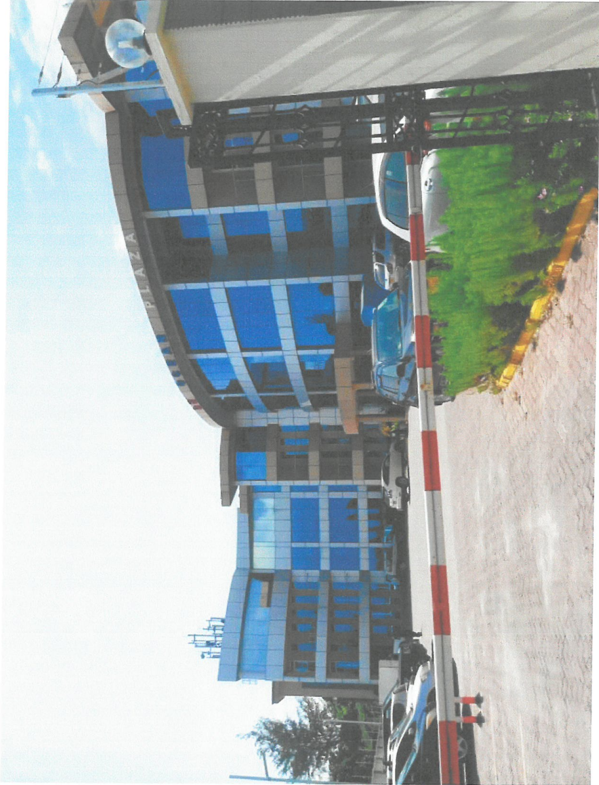
DE OCEAN PLAZA PLOT NO. 400, TOURE DRIVE, DAR ES SALAAM