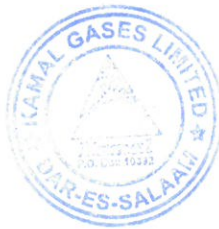
Kamal Gases Ltd Director.