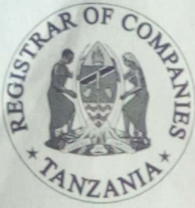
Princ. Asst. Registrar of Companies