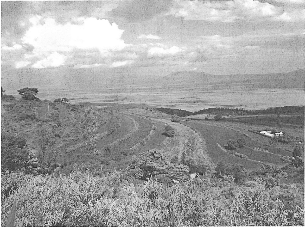
TERRACE FARMING AT LOSITETE GROUNDS IN KARATU DISTRICT.