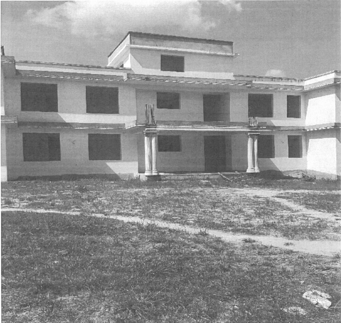
Photo2: Administrative Building