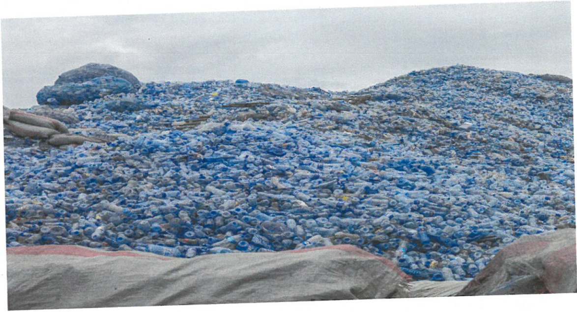
COLLECTED PET BOTTLES DIFEFERENT POINT COLLECTION