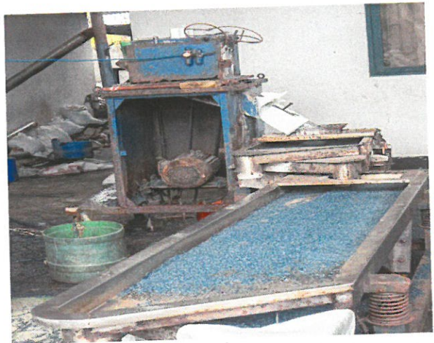
SHREDDING PROCESS (GRANULES AS FINAL PRODUCT)