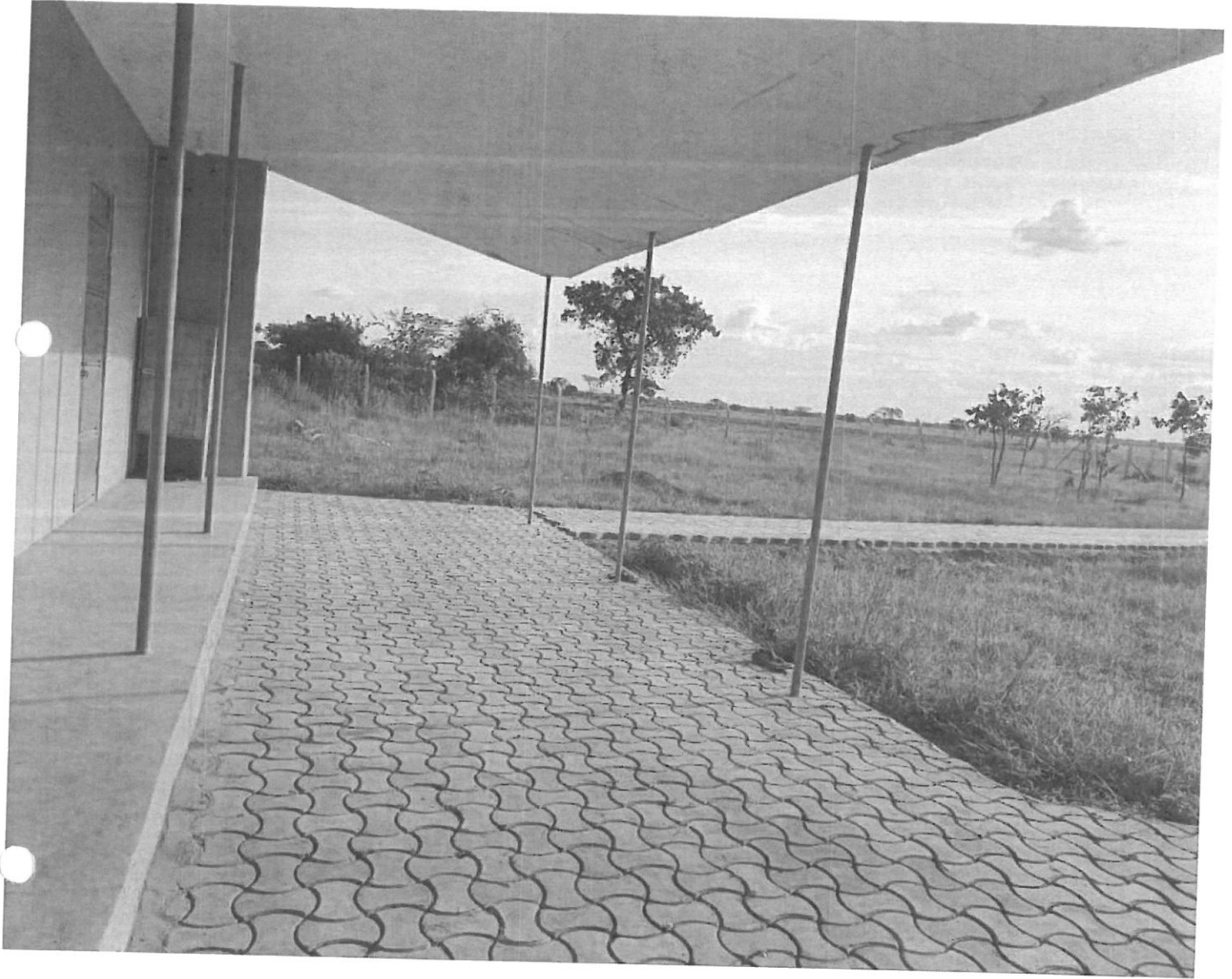
2. Construction of Administrative building at the site