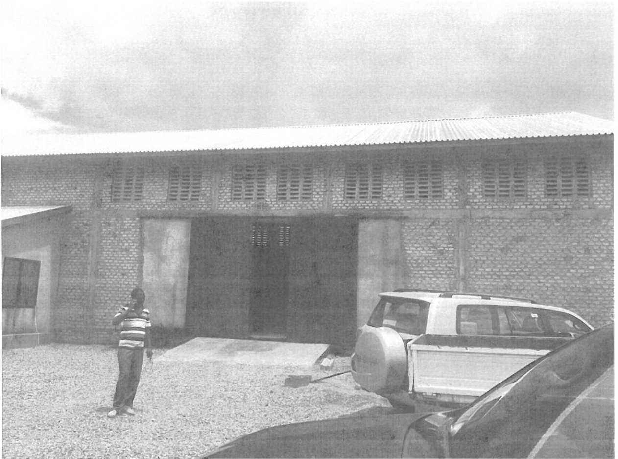
2. The Factory