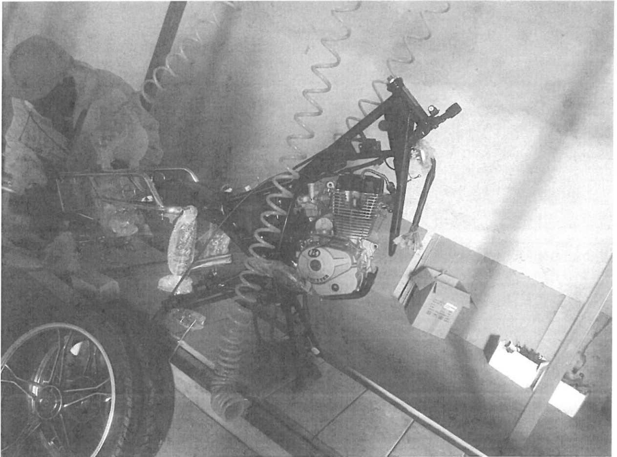
1. Motorcycle on Assembling process