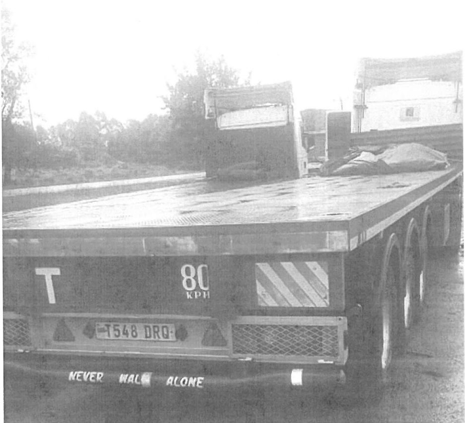
4. New Company Trailer