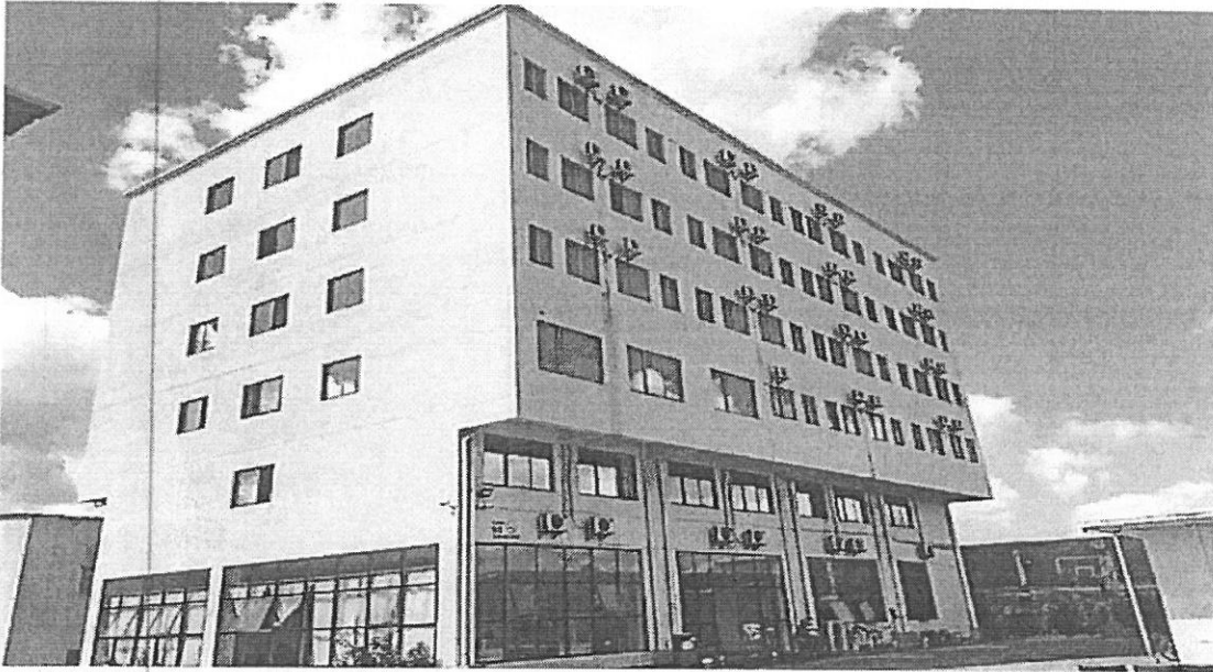
Side View of the Administration block This Building is used for offices and accommodation for staff