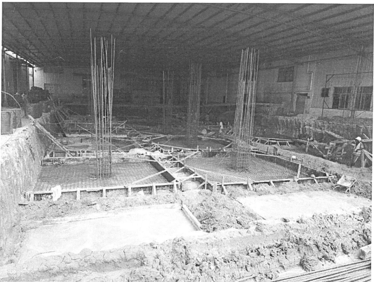
Additional 20,000tonnes capacity washing powder project in progress

We also intend to continue to focus on product research and development to ensure that our products meet our customers preference without compromising with quality.