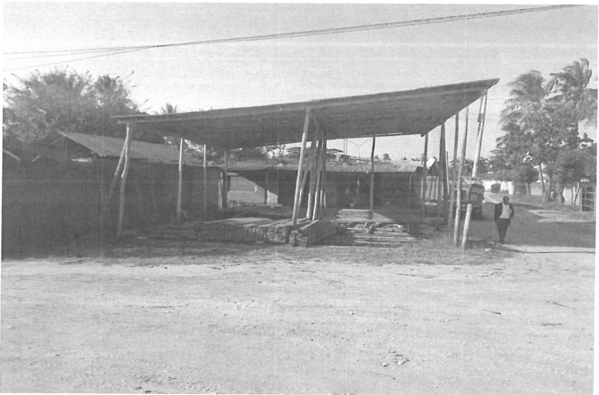
Front view of the Project Site