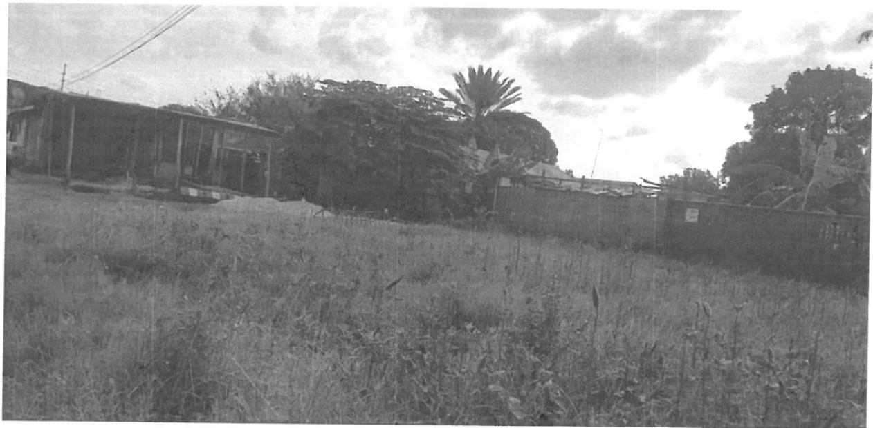
The Project Site (on the fore ground) includes the building on the back ground left.