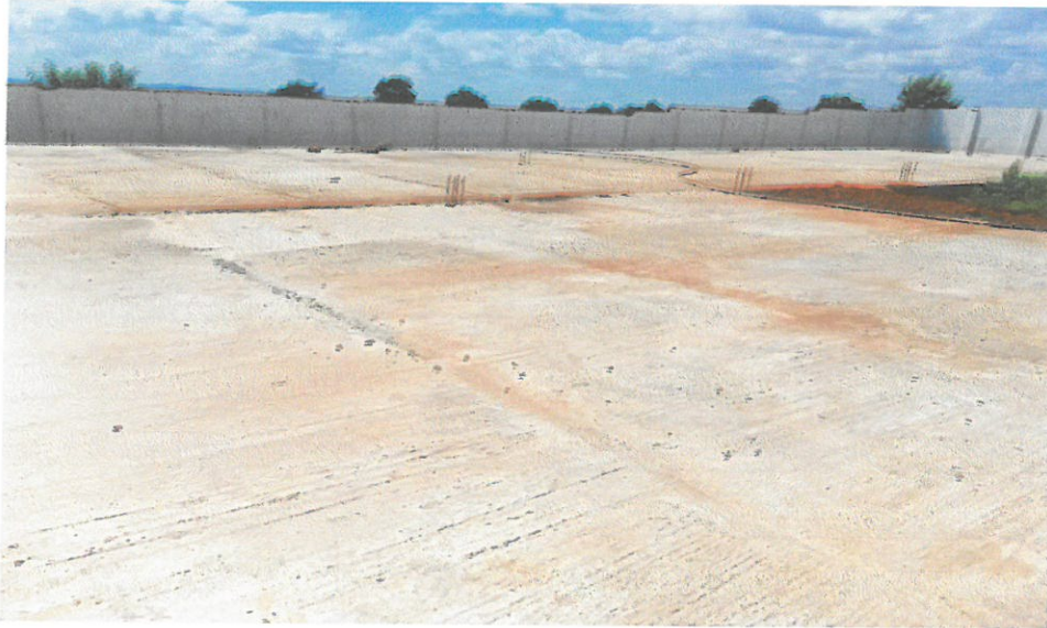
View of construction (at foundation stage) of factory building of Dominick Milling Group Limited