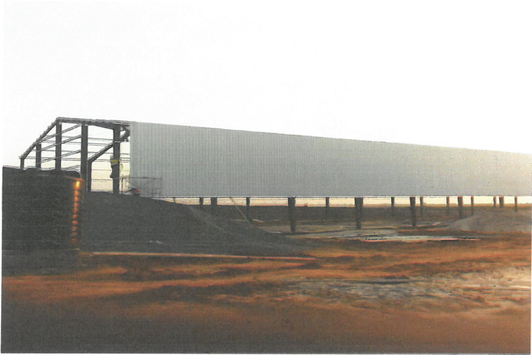
Contractors at work