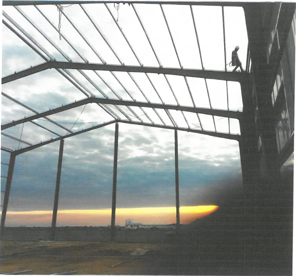
View of contractors at work Plot No. 204 Zegereni Industrial Area in Kibaha