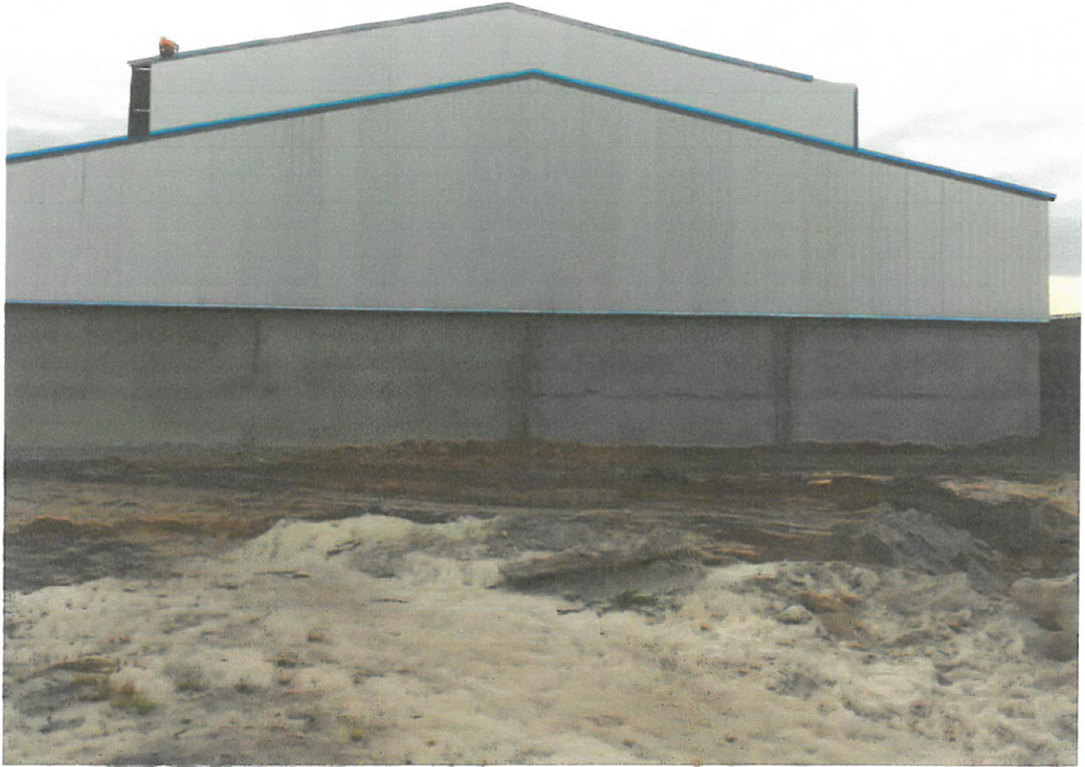
A warehouse under construction