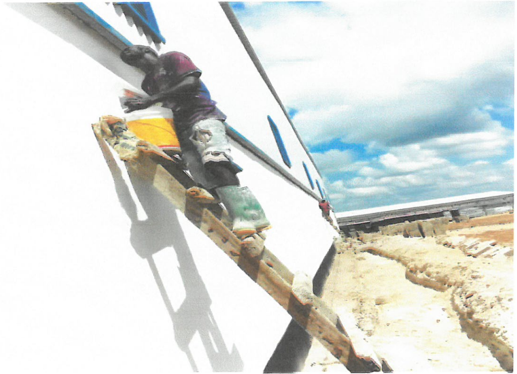
A contractors painting a warehouse