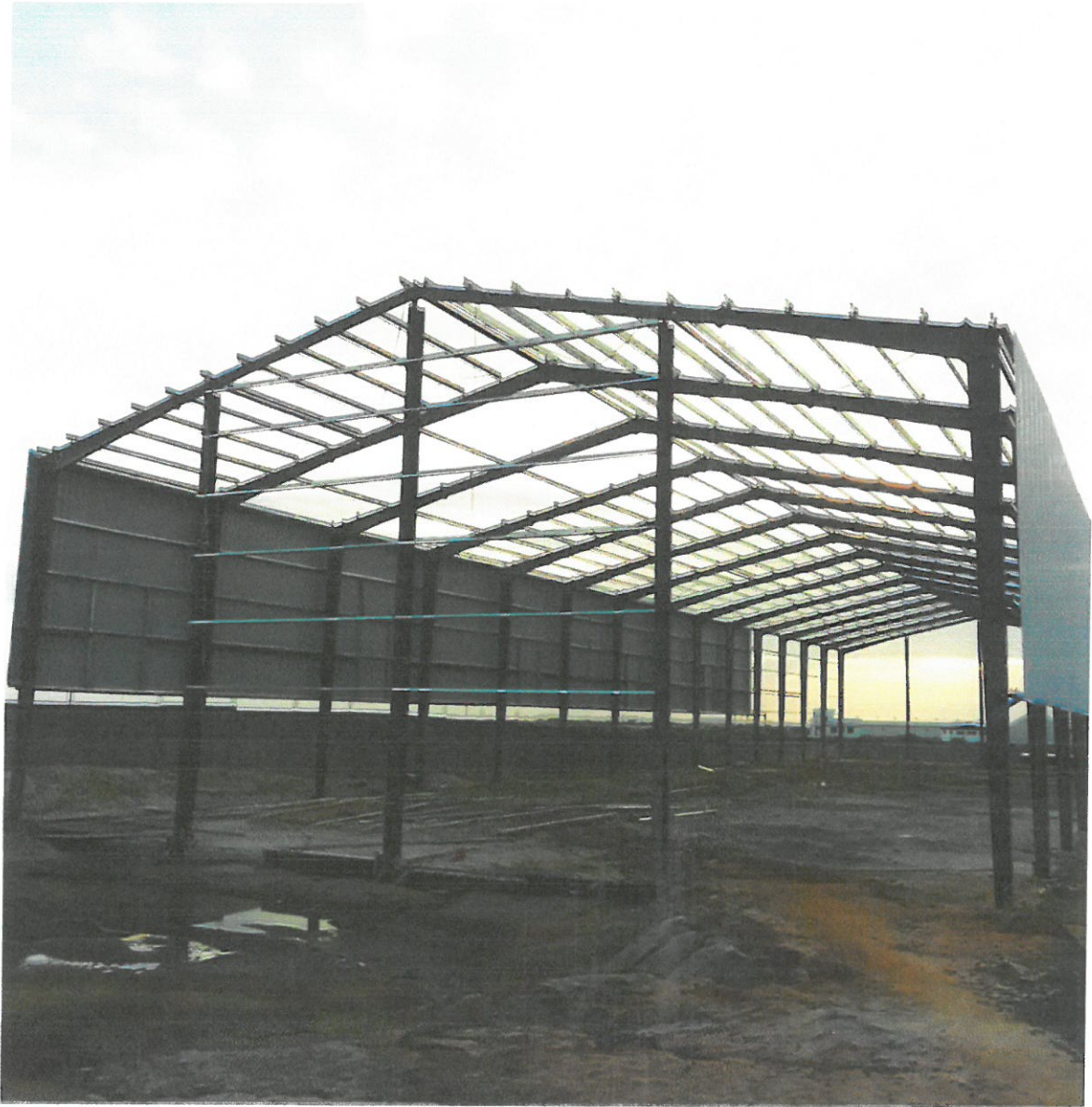
Contractors at work