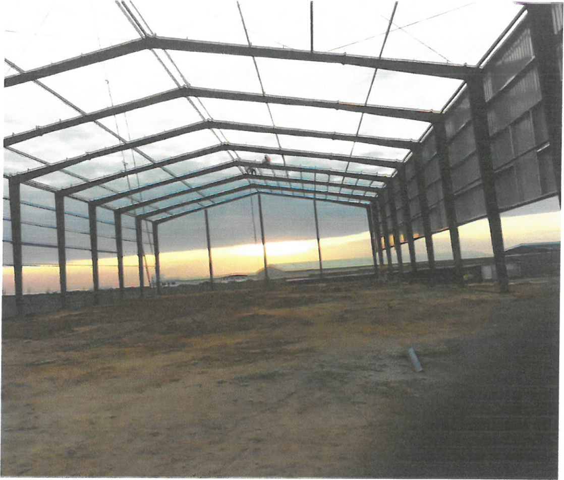
View of contractors at work at Dominick Milling Group Ltd