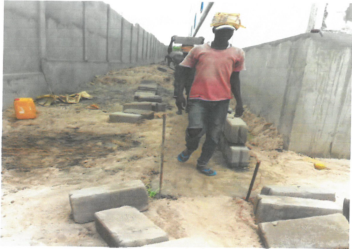
Casual workers at work