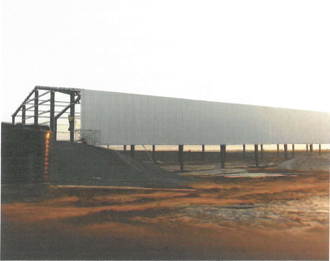
Contractors at work