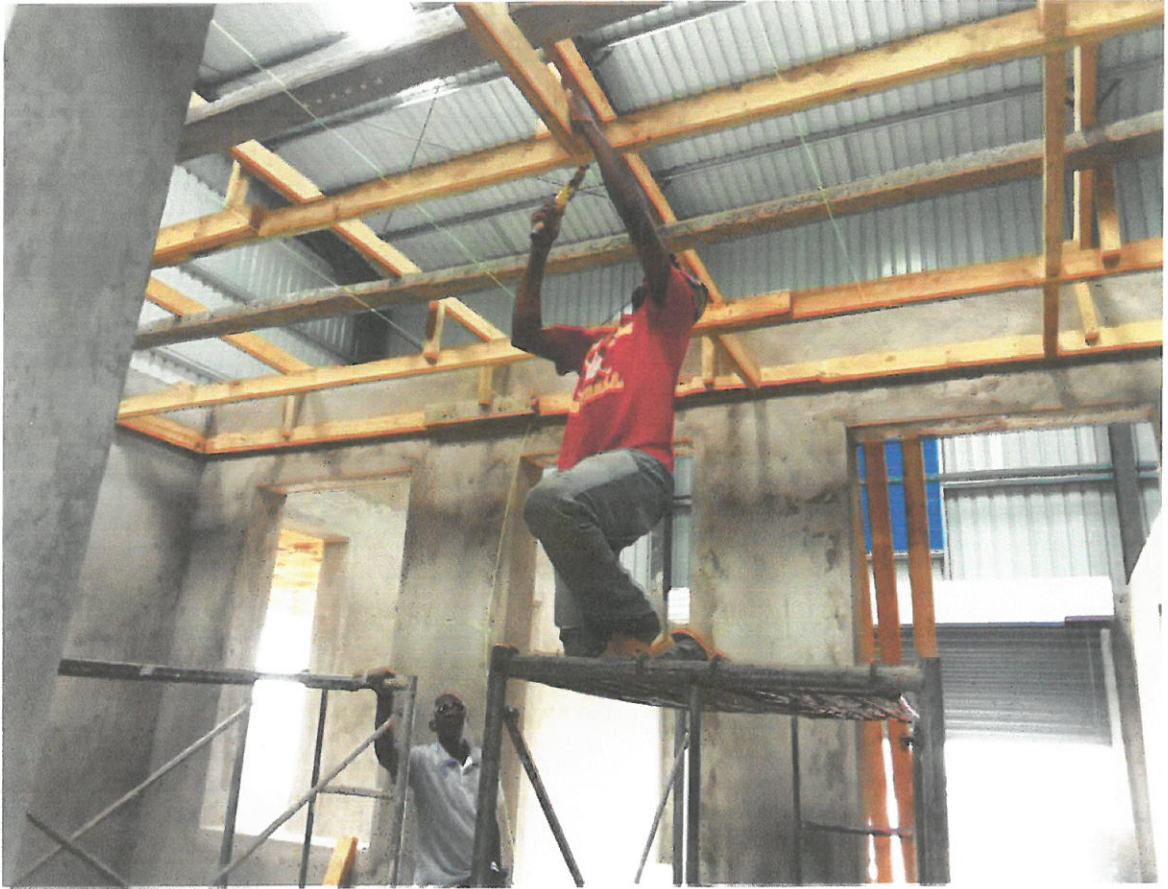
Contractors at work