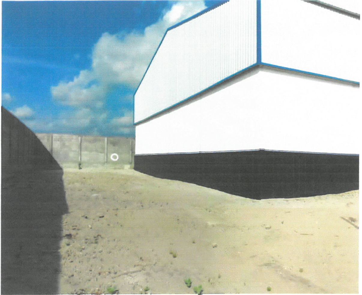
A warehouse under construction