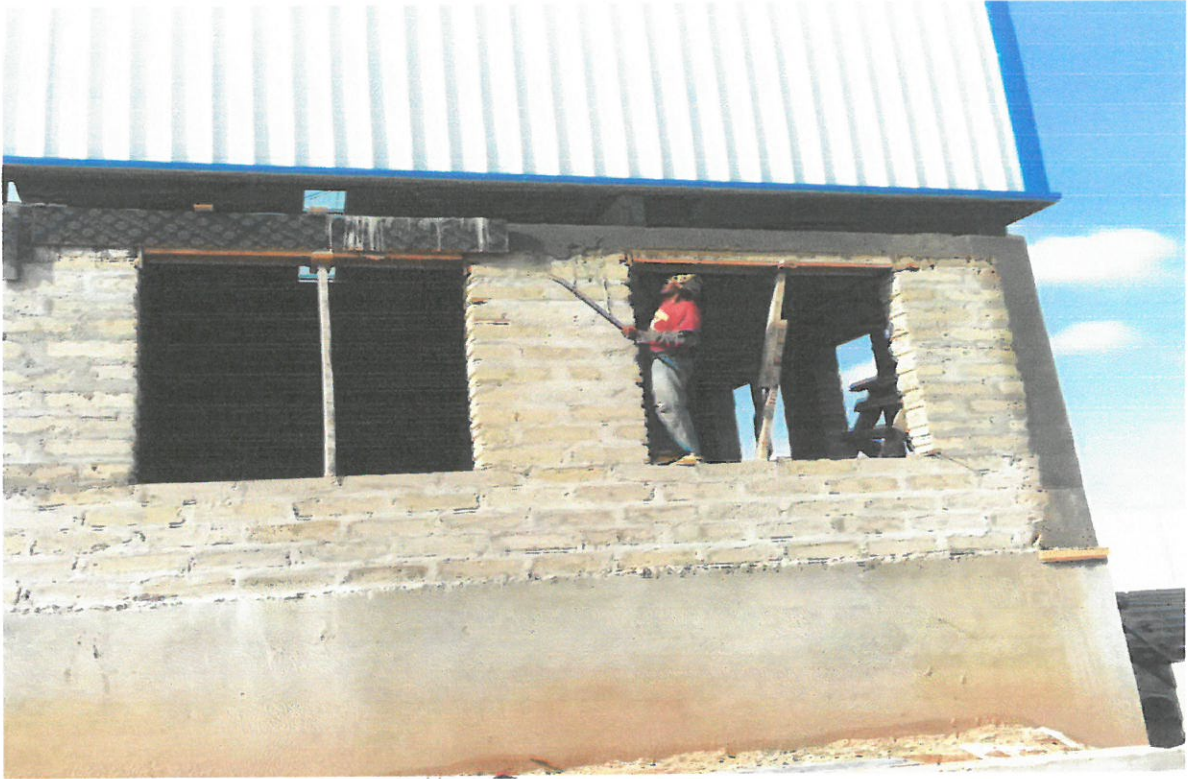
Contractors at work