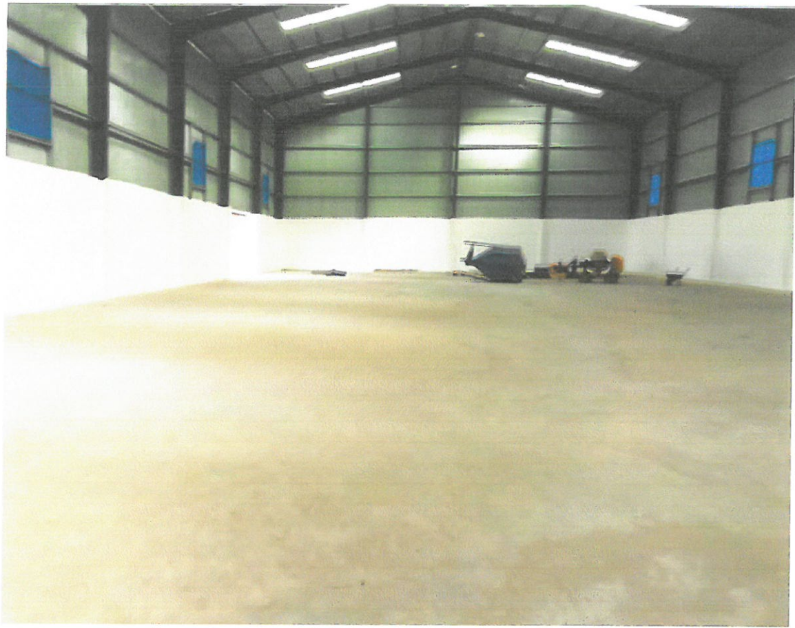
A warehouse under construction