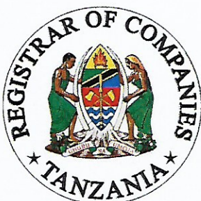
Registrar of Companies

NOTE. Information printed from the Register of Company is true and complete as per extract generation date and time. Please be advised to refer to the Online Registration System at BRELA ( ors.brela.go.tz ) for an up-to-date information regarding given Company.