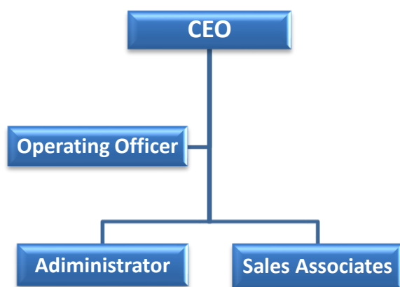
FIGURE 1: TMWENDO LOGISTICS TANZANIA LIMITED ORGANIZATIONAL CHART

TMWENDO Logistics Tanzania Limited management team will include the CEO who will manage the strategic direction, sales and marketing of the company. The Operating Officer will manage operations, finances, human resources, and procurement. The administrator, a sales associate and drivers. These individuals will be managed by the operating officer and the CEO, respectively.