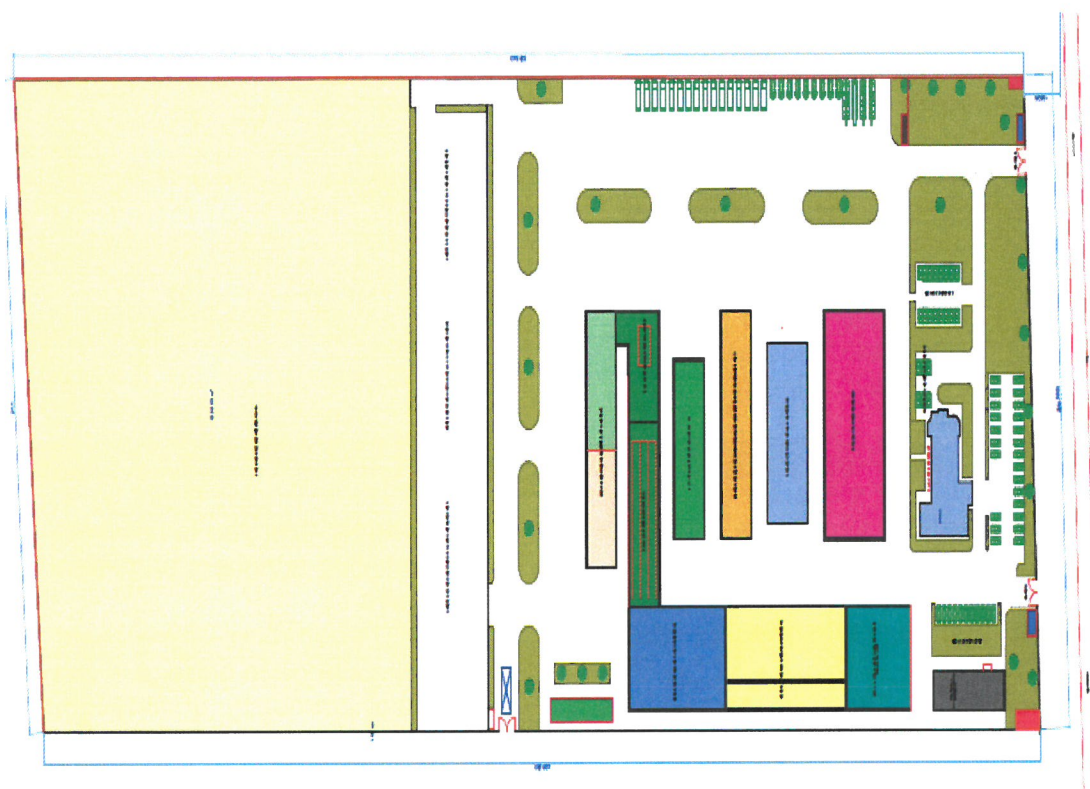
Figure 2. Layout plan reference of the Plant

The layout plan includes a unit for storage of raw materials, a composting unit, factory, offices, laboratories and the piloting fields for trials and tests.