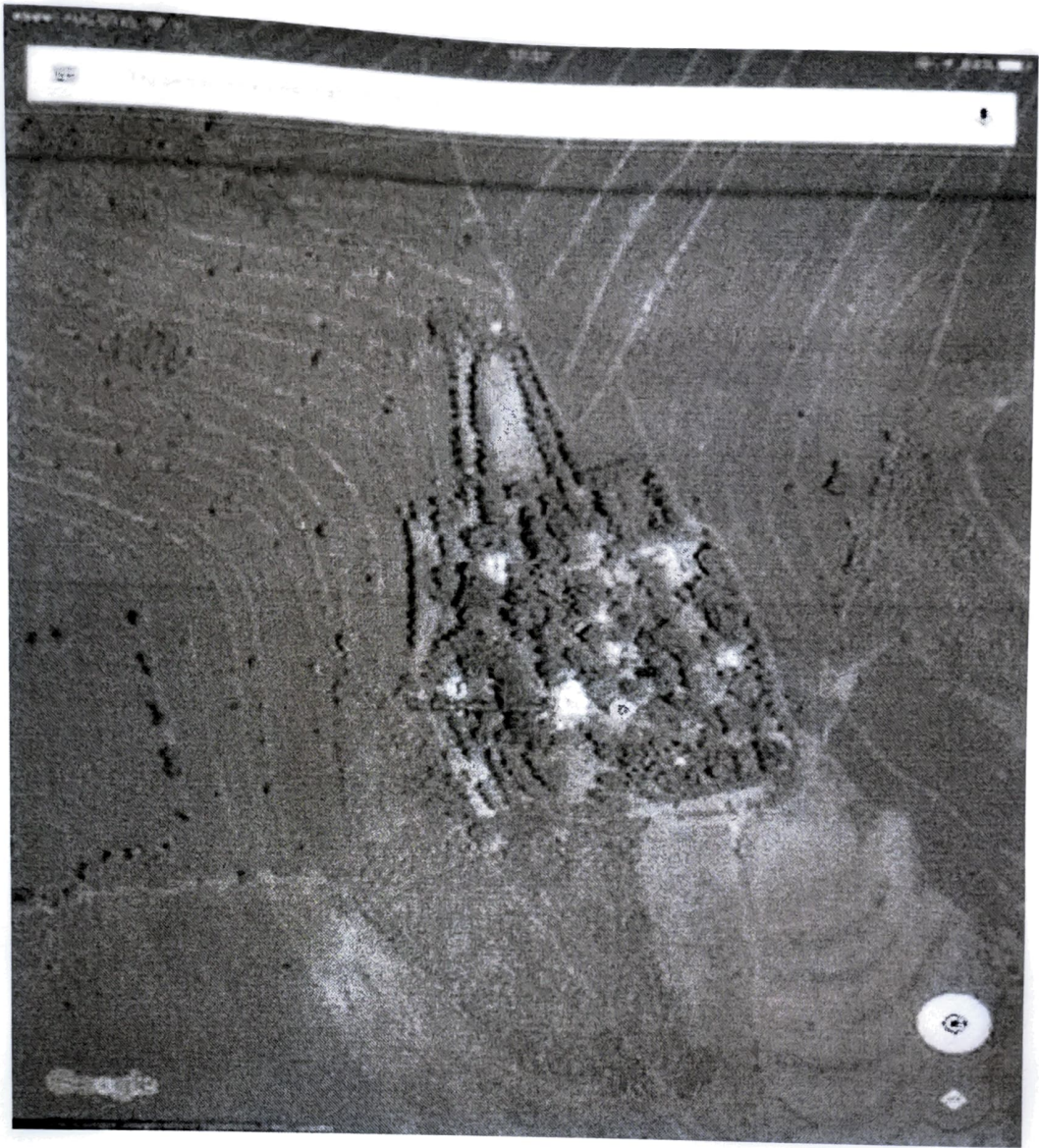
Google Earth image of Plantation Lodge property (demarcated by blue dot in the center) surrounded by commercial agriculture lands