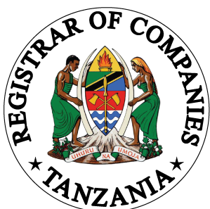
PRINC ASST. REGISTRAR OF COMPANIES

having, with sanction of a special Resolution of the said company, and with the approval of the Registrar signified in writing Changed its name, is now called DIRILIS FOODS AND BUILDING LIMITED and I have entered such new name on the Register accordingly this 2 nd day of NOVEMBER, TWO THOUSAND AND TWENTY ONE.