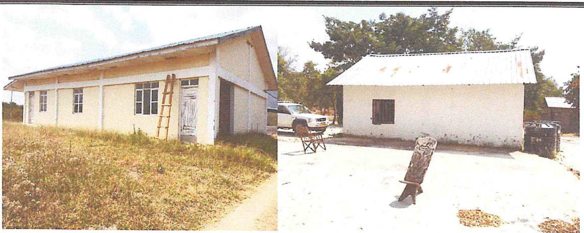
PLATE VII: STORE BUILDING