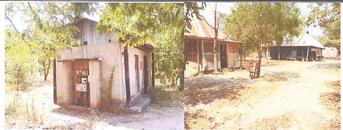
PLATE VIII: CHANGING BUILDING AND CAMPING HOUSES