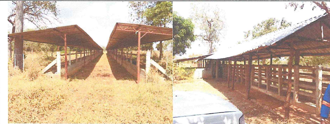
PLATE XIII: FEEDING SECTION & COW MEDICATION AREA