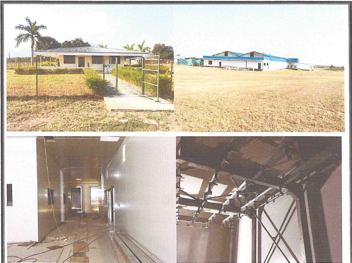
PLATE I: FRONT & SIDE VIEW OF THE ADMINISTRATION AND ABATTOIR BUILDING (INSIDE THE ABATTOIR)