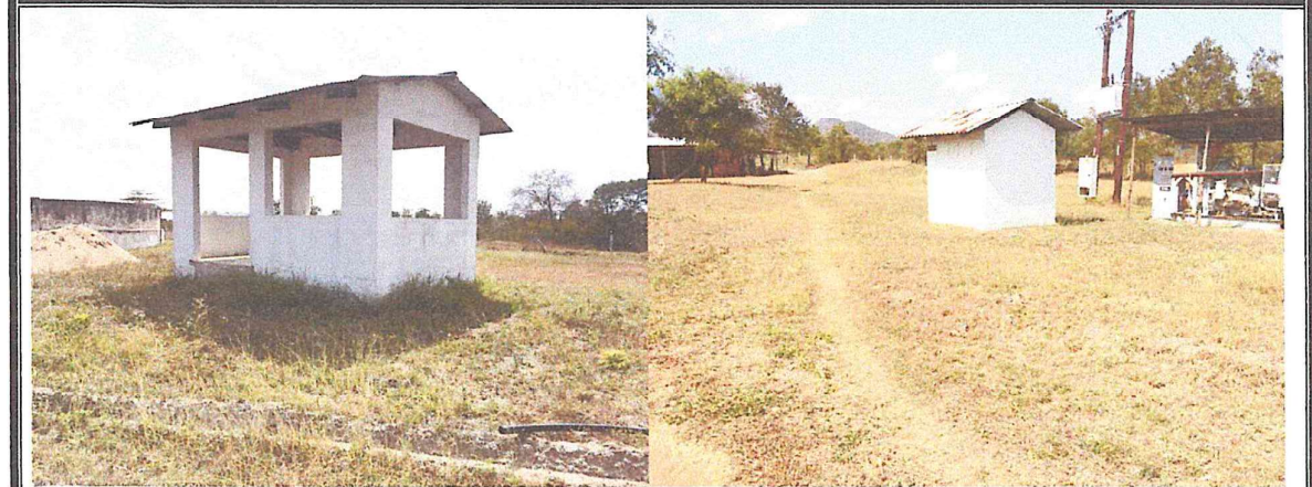
PLATE V: FRONT & SIDE VIEW OF THE GUARD HOUSE & POWER HOUSE