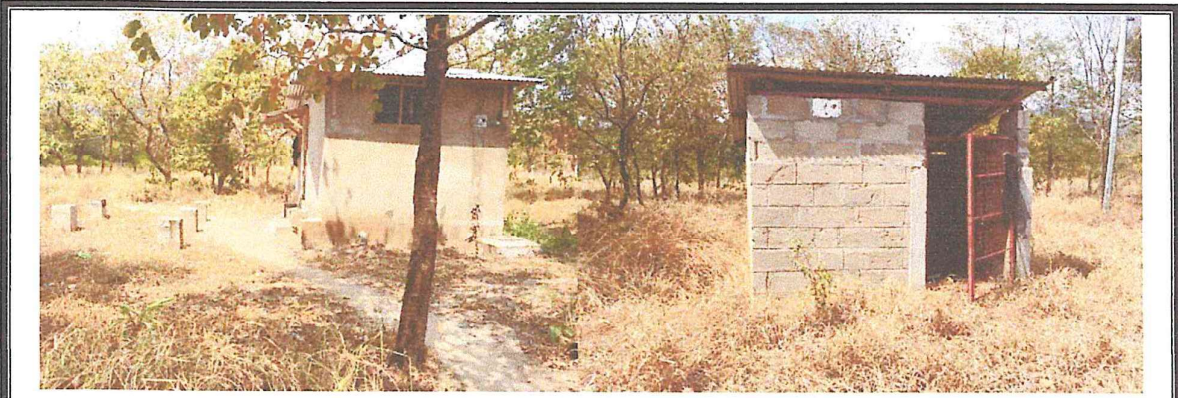
PLATE IX: STORE BUILDING & POWER HOUSE