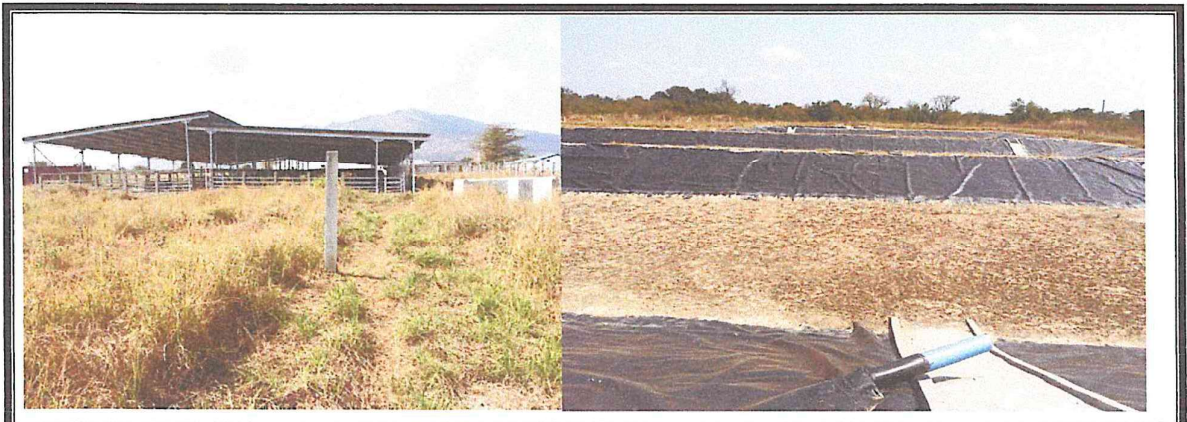
PLATE III: STOCK YARD & PONDS