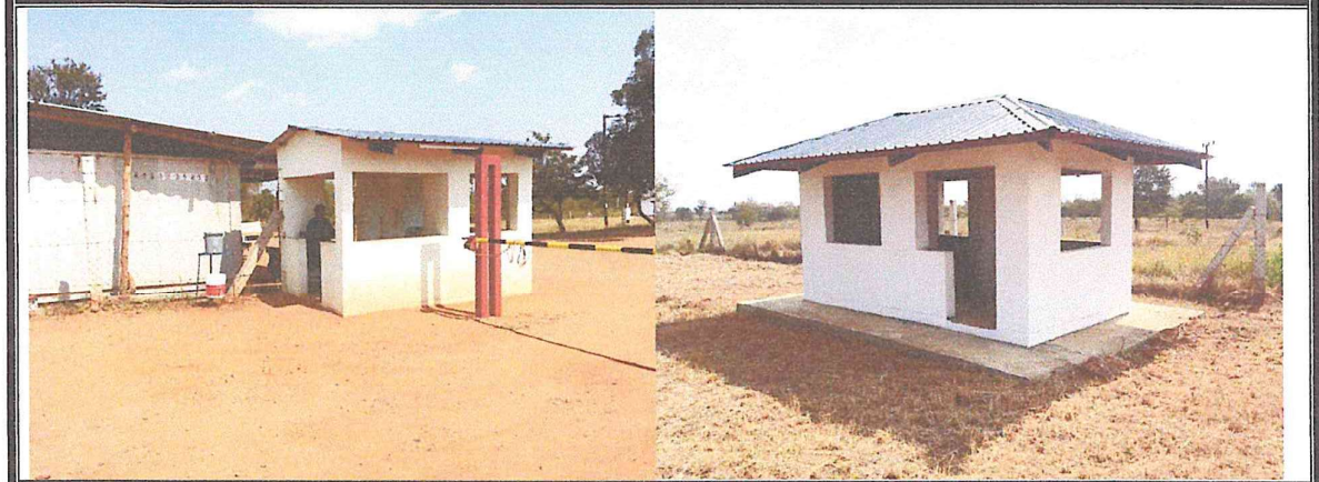
PLATE IV: FRONT & SIDE VIEW OF THE GUARD HOUSES