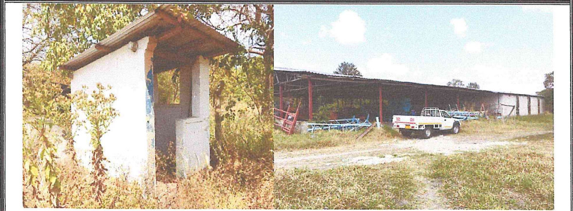
PLATE X: SECURITY GUARD AND FEED PRODUCTION BUILDING