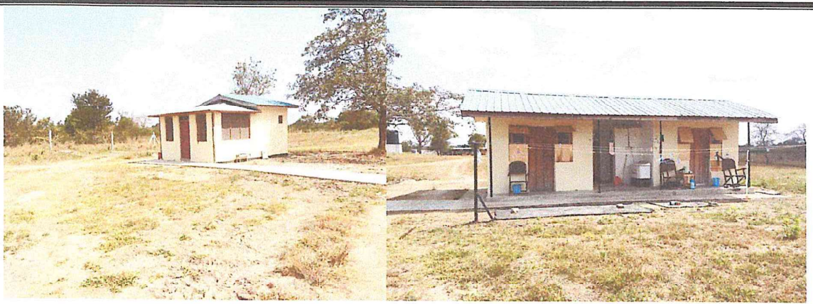
PLATE VI: FRONT VIEW OF THE KITCHEN & SERVANT QUARTER