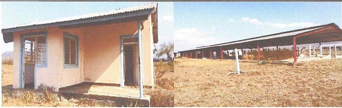
PLATE XII: OLD STUFF BUILDING & HERD SHED