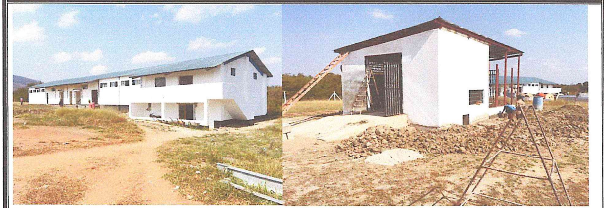
PLATE II: FRONT & SIDE VIEW OF THE ABLUTION BLOCK & POWER HOUSE