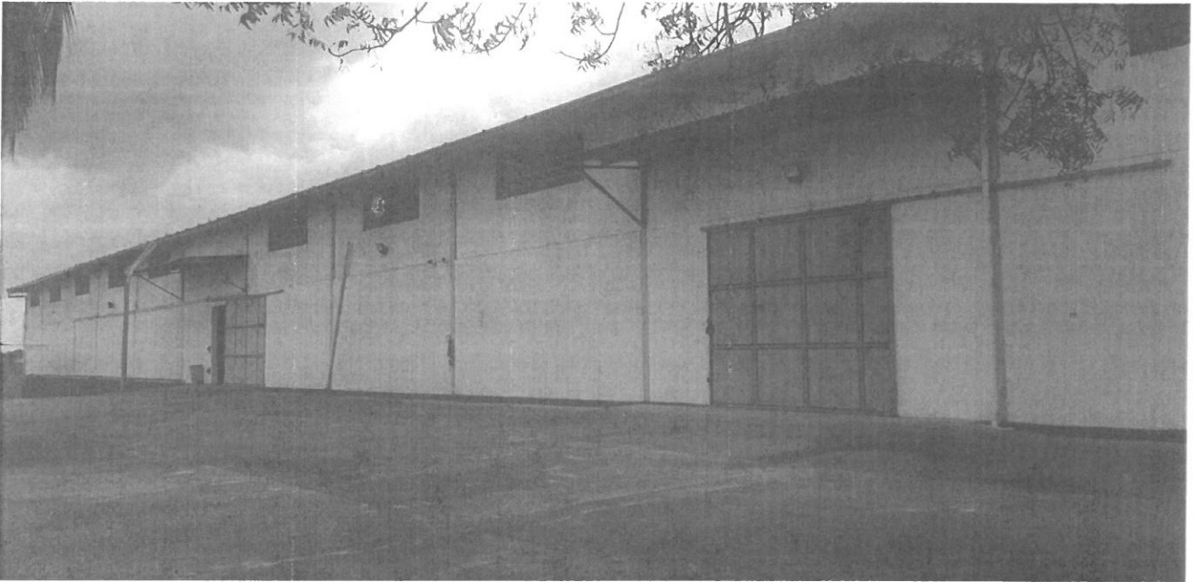
Pic.1 Warehouse rented to Fragrance World Factory

The pictures below show the development made on the site