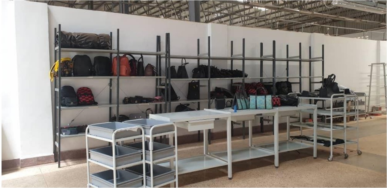
Leather articles produced by the Leather Articles production factory