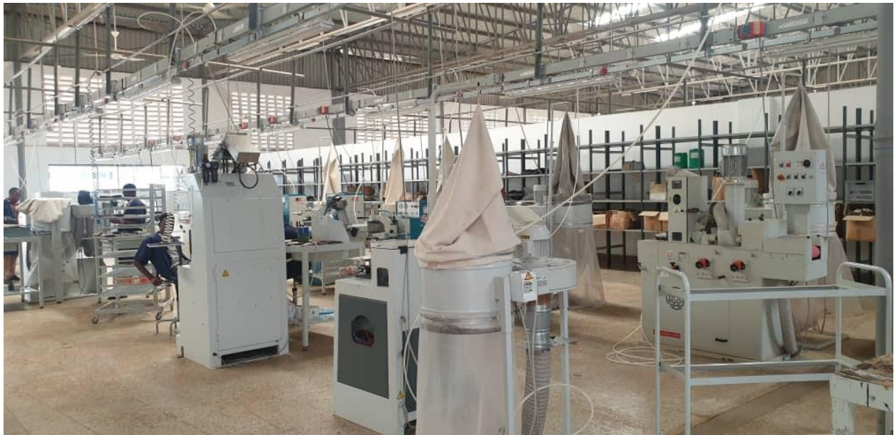
Shoe- soles production factory