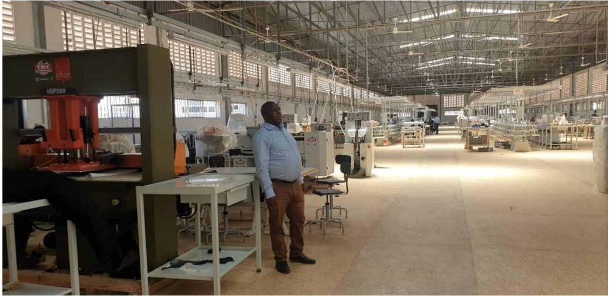
Cutting and Stitching Factory