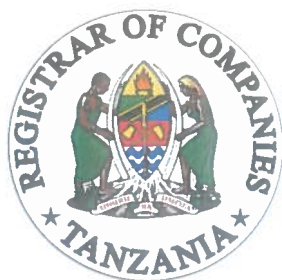
PRINC ASST. REGISTRAR OF COMPANIES

GIVEN under my hand at Dar es Salaam this 12 th day of MARCH TWO THOUSAND AND TWENTY ONE.