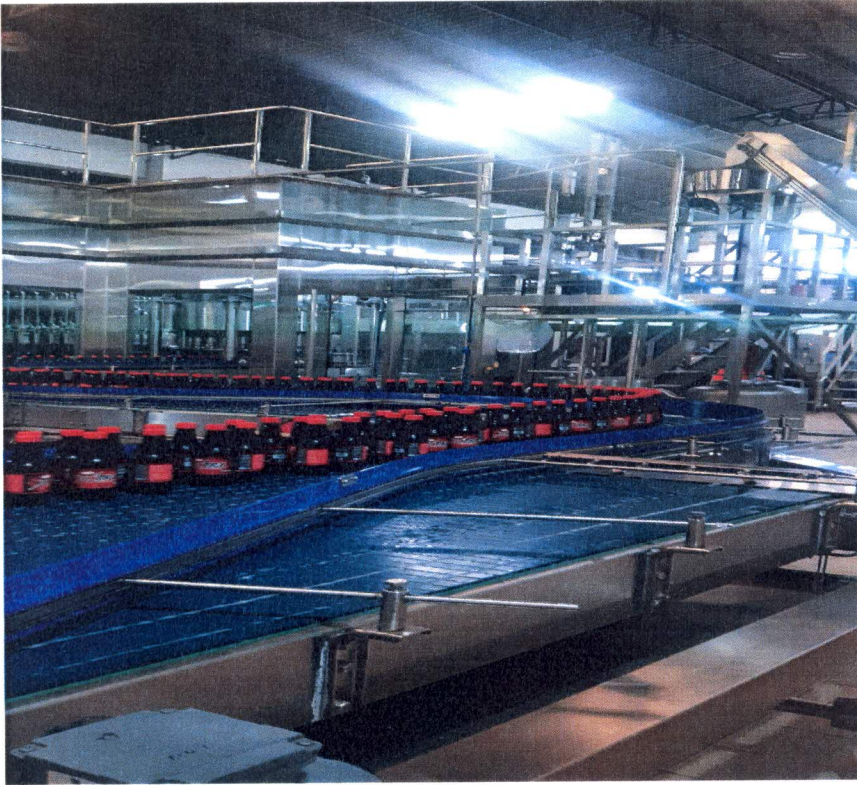
Maisha Bottlers and Beverages Plant in production