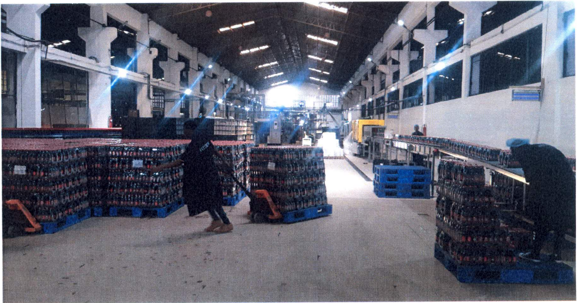
Maisha Bottlers and Beverages Storage facility