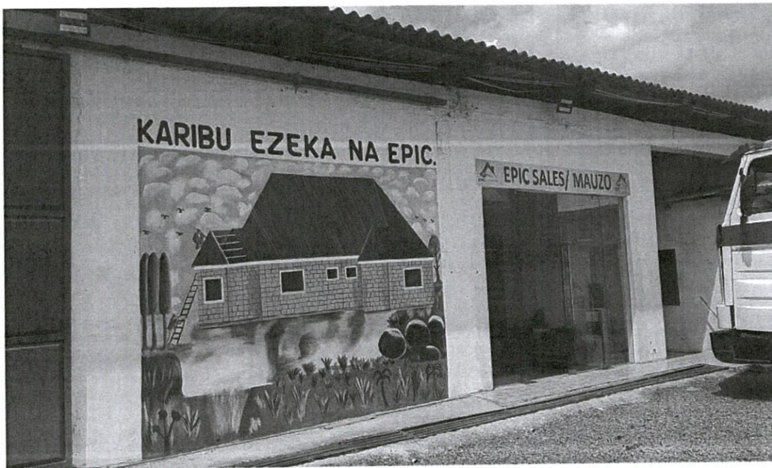
Plate 2: Frontage of selling room.