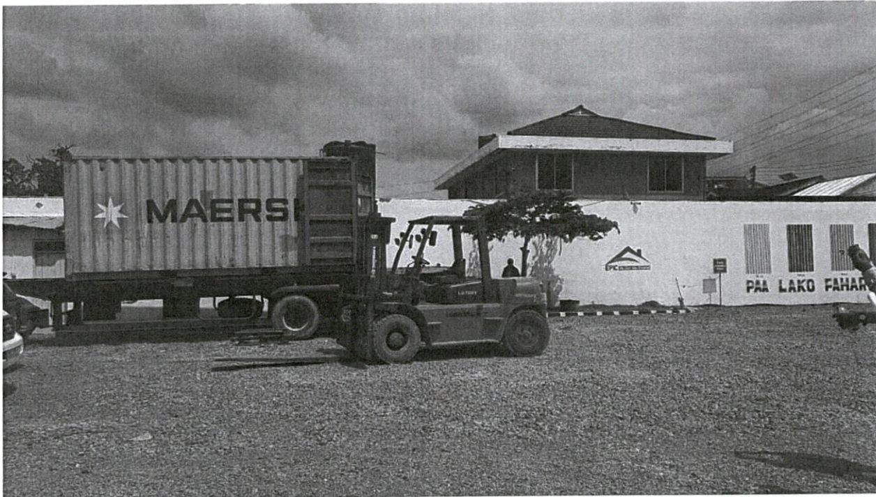
Plate 3: folk lift parked at site