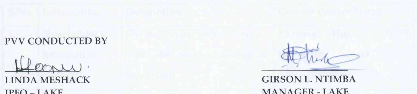
Table 1- Zhen Hua Company Limited Company Information