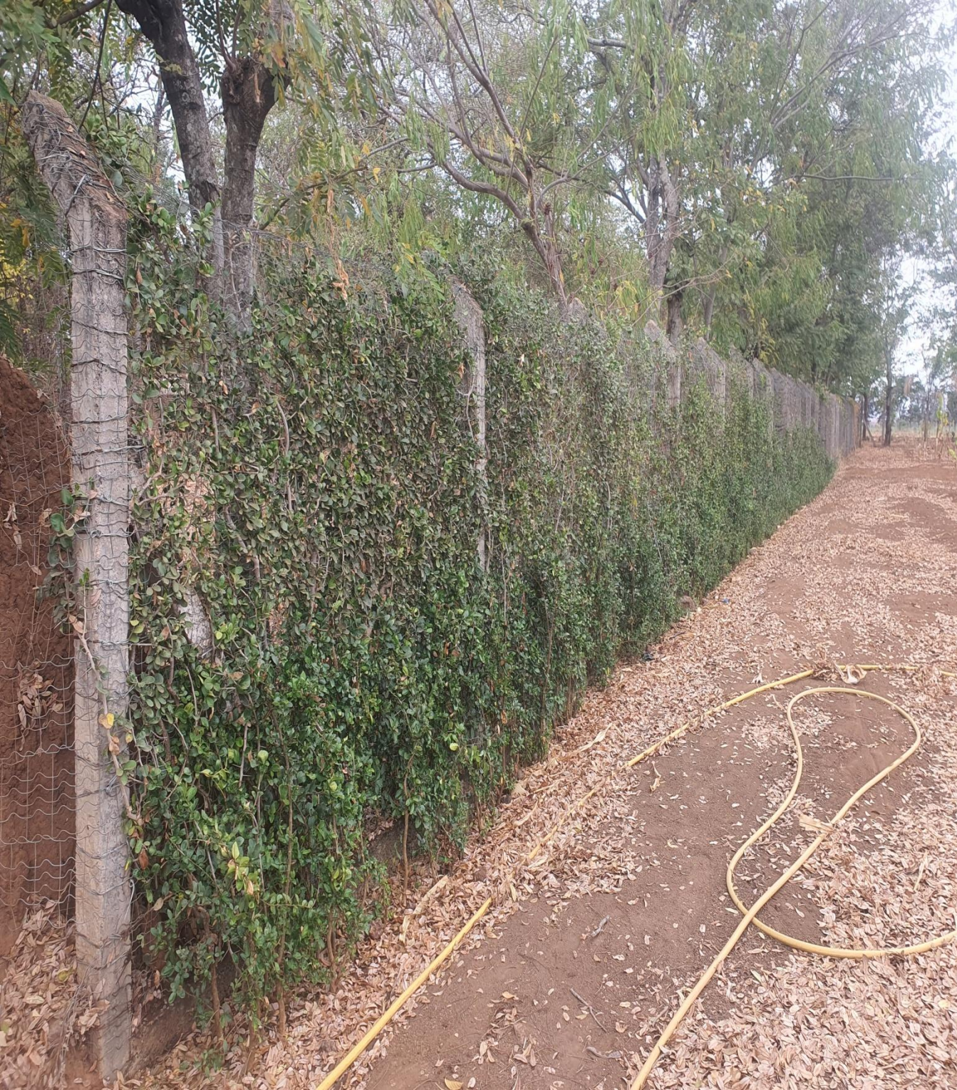
Wire fencing surrounding the plot's boundary