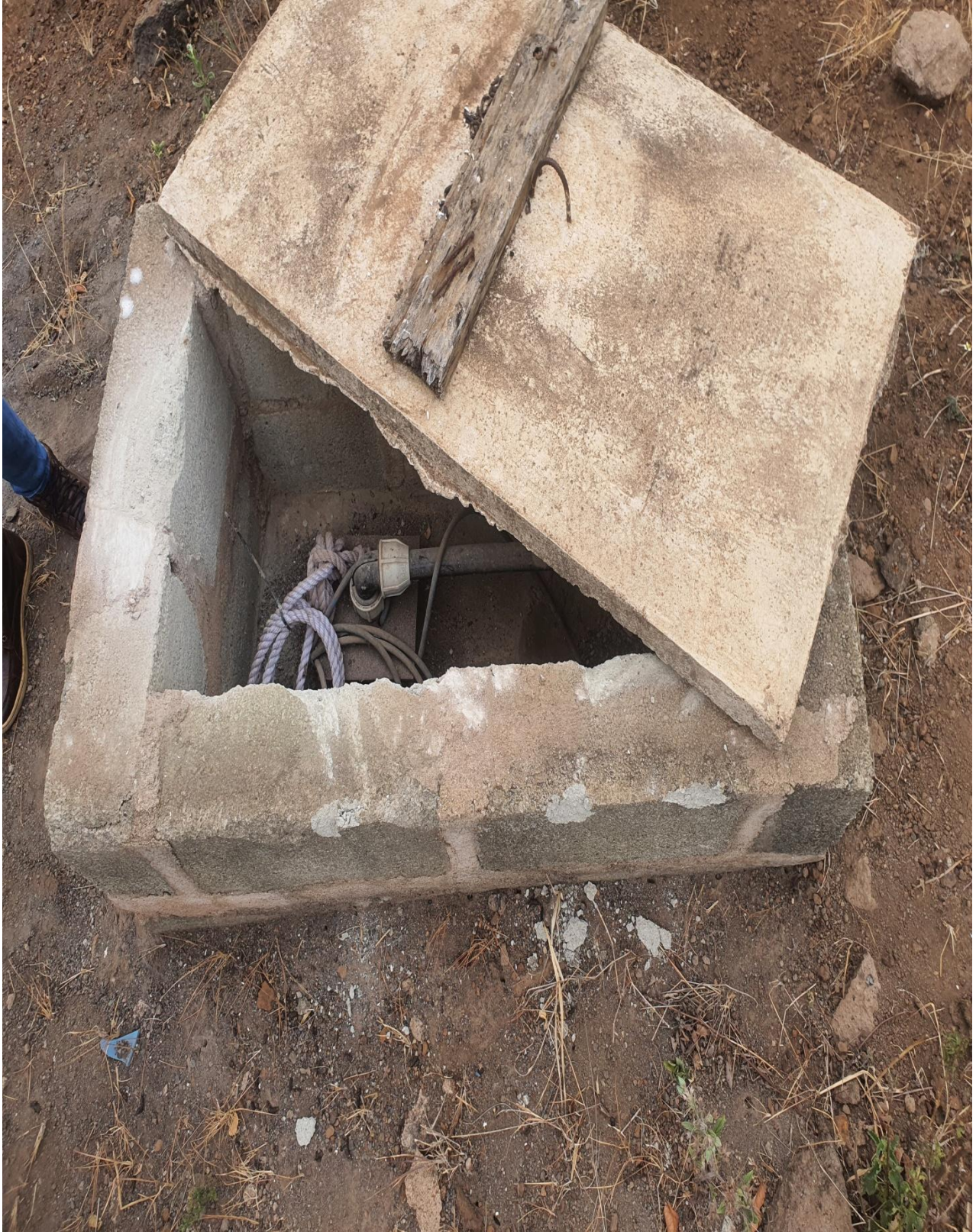
Electrical water pump at the project location(Site)