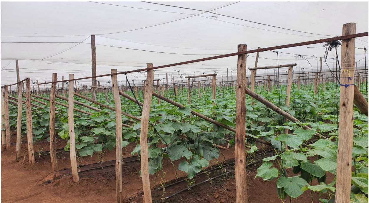
Cucumber plants in the agricultural net as the crucial stage of producing hybrid Seed