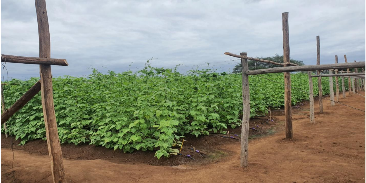
Beans plant for producing bean seeds for export