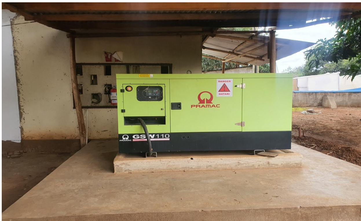
110 KVA generator as one of the infrastructure installed in the farm