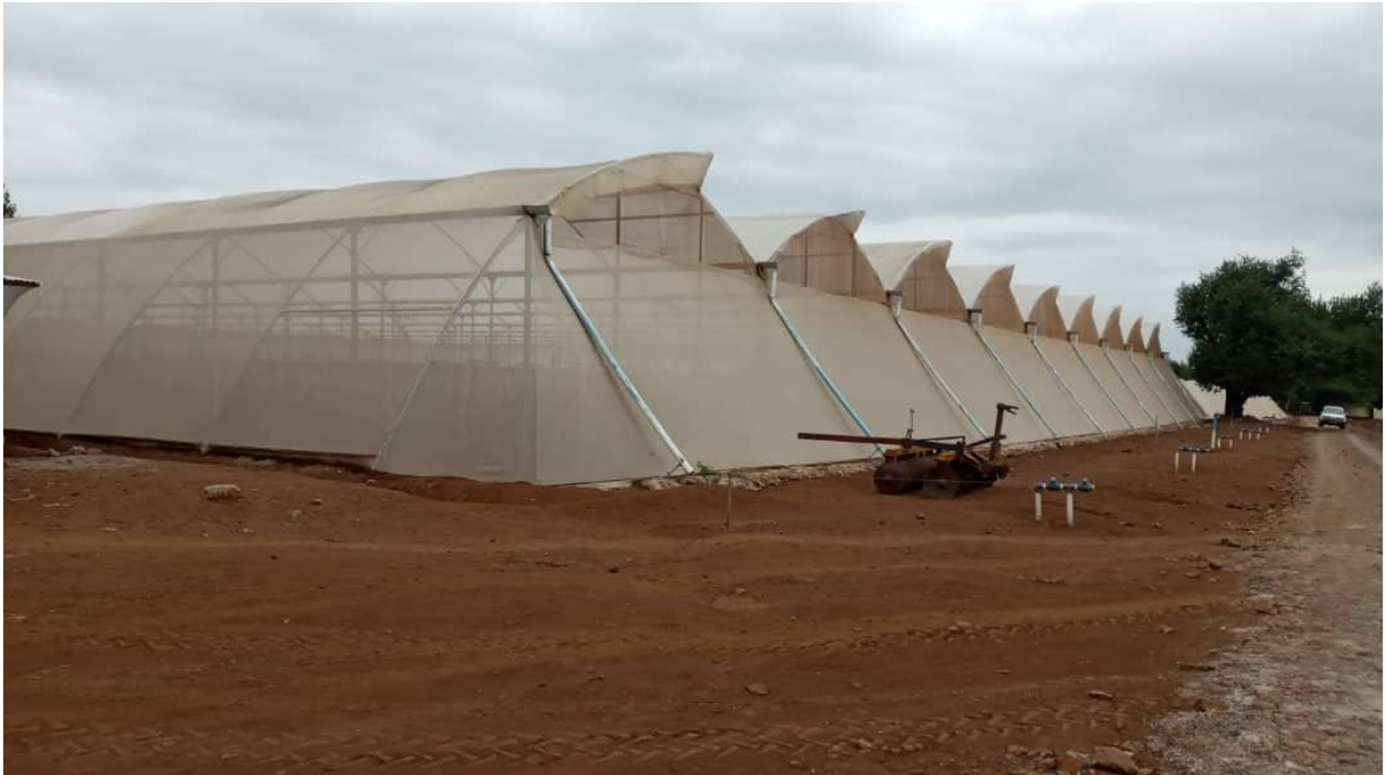
Green house installed on 0.5 hector at the farm