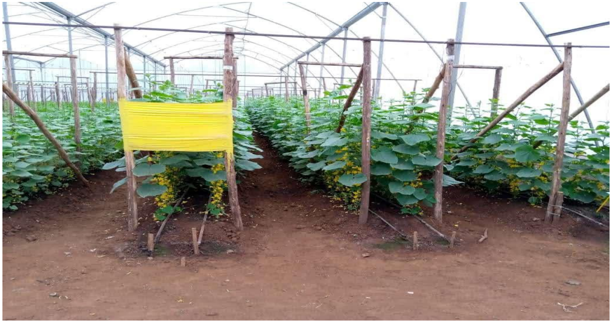
Farming in the green house for production of hybrid seeds