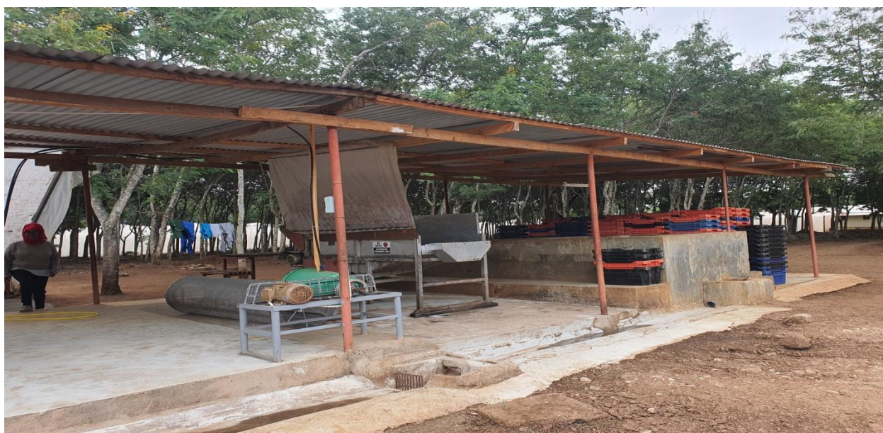
An area for cleaning and drying the seeds before packaging ready to be stored