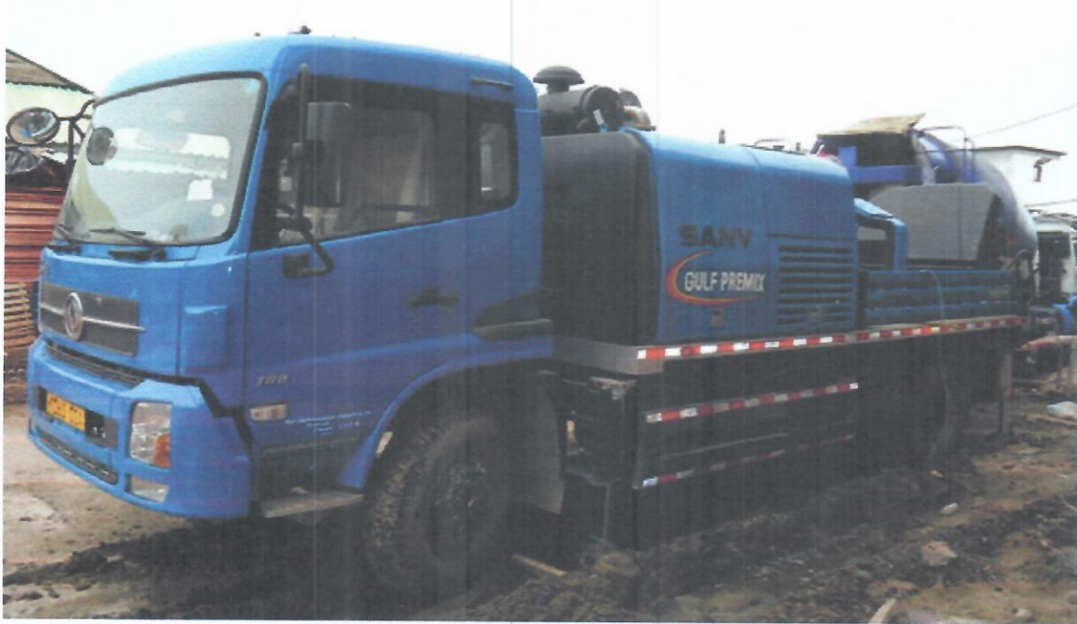
Truck-mounted concrete pump