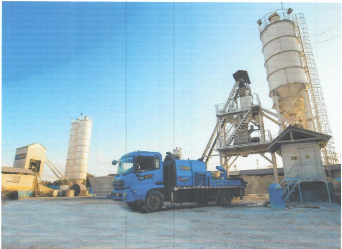
Cement Silo in Mikocheni Plant

Lake Premix and Cement Products Limited in 10 years of operation, this unit achieved a sales turnover of USD 5 million a month. It boasts of major clients like Strabag, Group 6 International, China Civil Engineering Construction Company, Yapi Merkez etc who are major international civil contractors engaged by EAC governments. This unit is almost approaching sales of 100,000 cubic meters of premix per annum. This 10years old division of Lake Group is poised to be an integrated supplier to the ongoing construction industry in Tanzania, recently the Company is having 8 Cement Silo plant in the Premix Division.