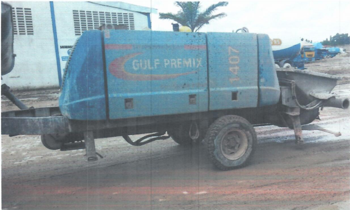
Trailer-mounted boom concrete pump

ii. Lake Premix and Cement Products Limited is currently having 10 mobile Concrete Pumps. The first type of concrete pump is attached to a truck. It is known as a trailer-mounted boom concrete pump because it uses a remote-controlled articulating robotic arm (called a boom) to place concrete accurately. Boom pumps are used on most of the larger construction projects as they are capable of pumping at very high volumes and because of the labor saving nature of the placing boom. They are a revolutionary alternative to truck-mounted concrete-pumps