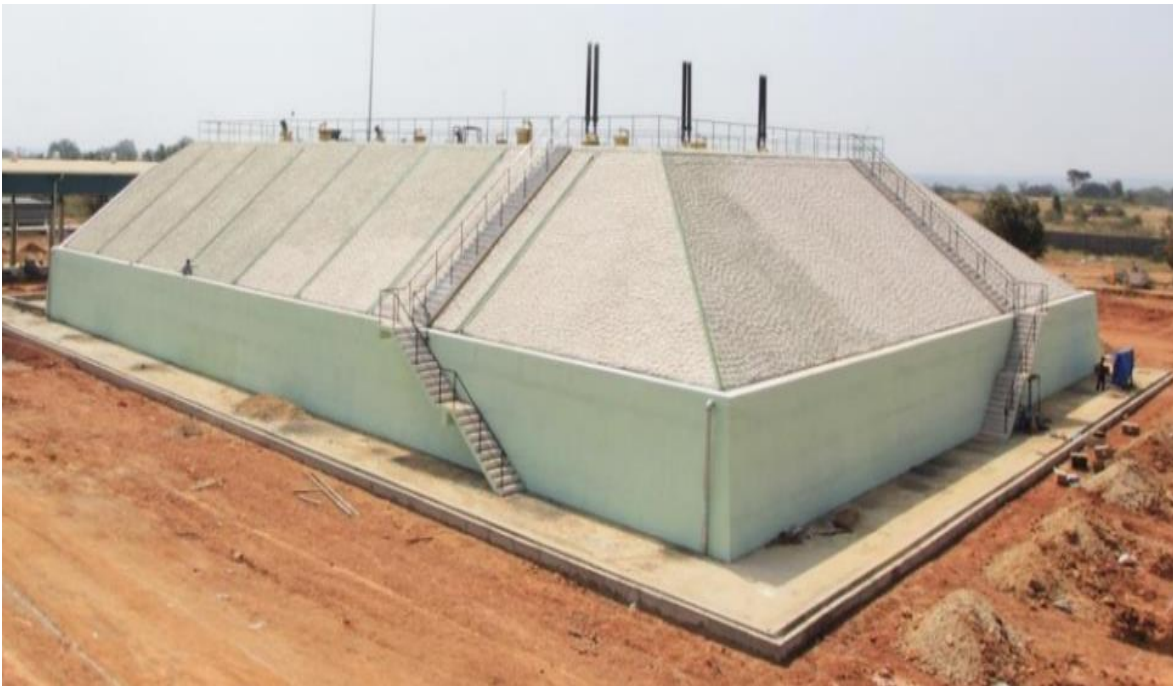
LPG mounded tank

OILCOM (T) LIMITED aimed at expanding her petroleum production process by establish production of liquefied petroleum gas, bulk storage, cylinder and truck filling industry at Kurasini industrial area in Dar es Salaam, Tanzania. The company will Refinery gas sweetening is the process used to purify a gas stream for further use in a process. The company will purchase the following set complete set of gas production facilities as prescribed section 1.5 to this report. Storage tanks for gas production, the anticipated capacity of 5 storage tanks with capacity of 3,750MT per tank. The construction of Tanks will build with high quality moulded bullet with total capacity of 15,000MT which will make the largest plant in Tanzania and the second largest in Eastern Africa after AGOL in Mombasa, Kenya. From moulded, the bullets will be of sounded by land and covered by high grade reinforced concrete which enhance storage safety.