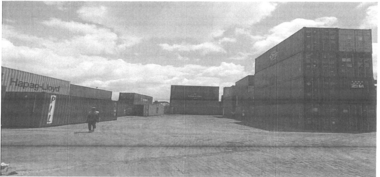
A container yard accommodated 4000 containers.