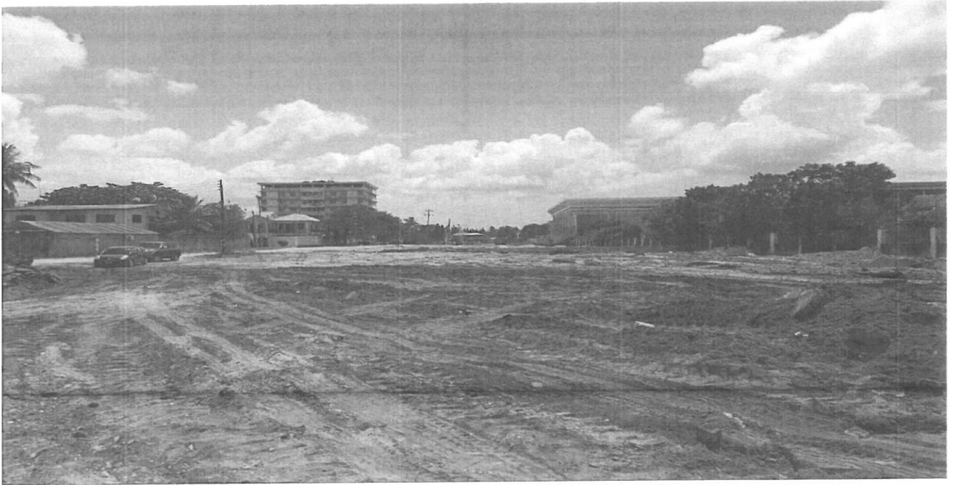
Reserved Parking Yard leased by promoters for truck parking