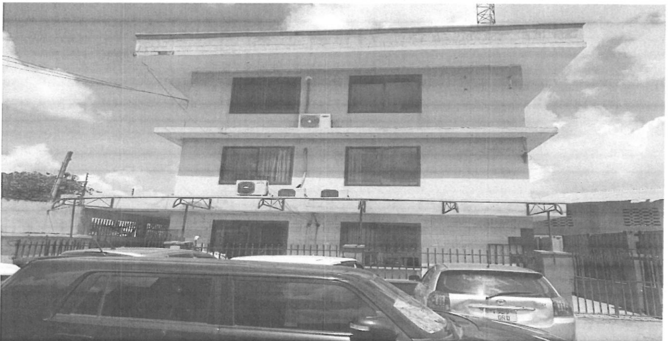
2 floor office building for the project