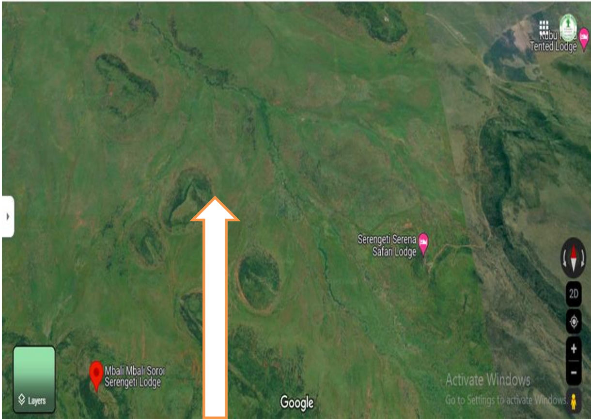
Location of the Project Site.