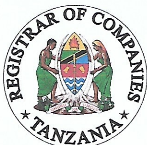
Princ. Asst. Registrar of Companies

NOTE. Information printed from the Register of Company is true and complete as per extract generation date and time. Please be advised to refer to the Online Registration System at BRELA ( ors.brela.go.tz ) for an up-to-date information regarding given Company.