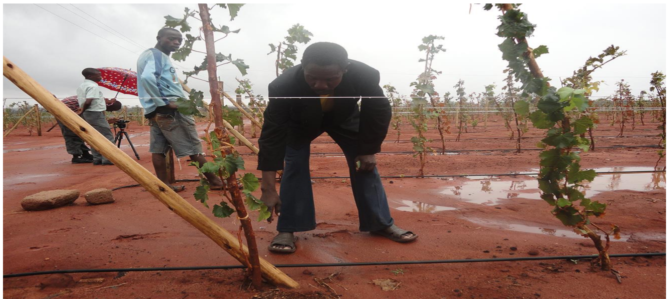
Operation of WENDECE Winery Industry will assure small grappes farmers around Dodoma to have a point for selling their grapes