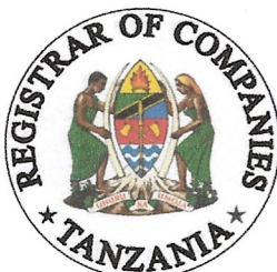
Princ. Asst. Registrar of Companies

NOTE. Information printed from the Register of Company is true and complete as per extract generation date and time. Please be advised to refer to the Online Registration System at BRELA (ors.brela.go.tz) for an up-to-date information regarding given Company.