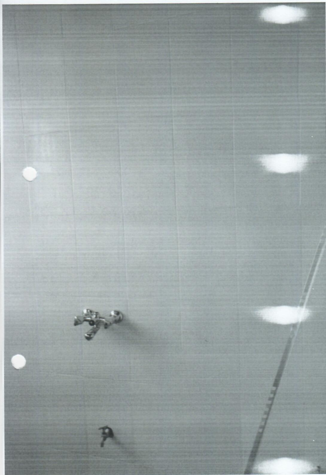
Picture 3. Construction of one of the accommodation rooms in the project site in Mbogwe