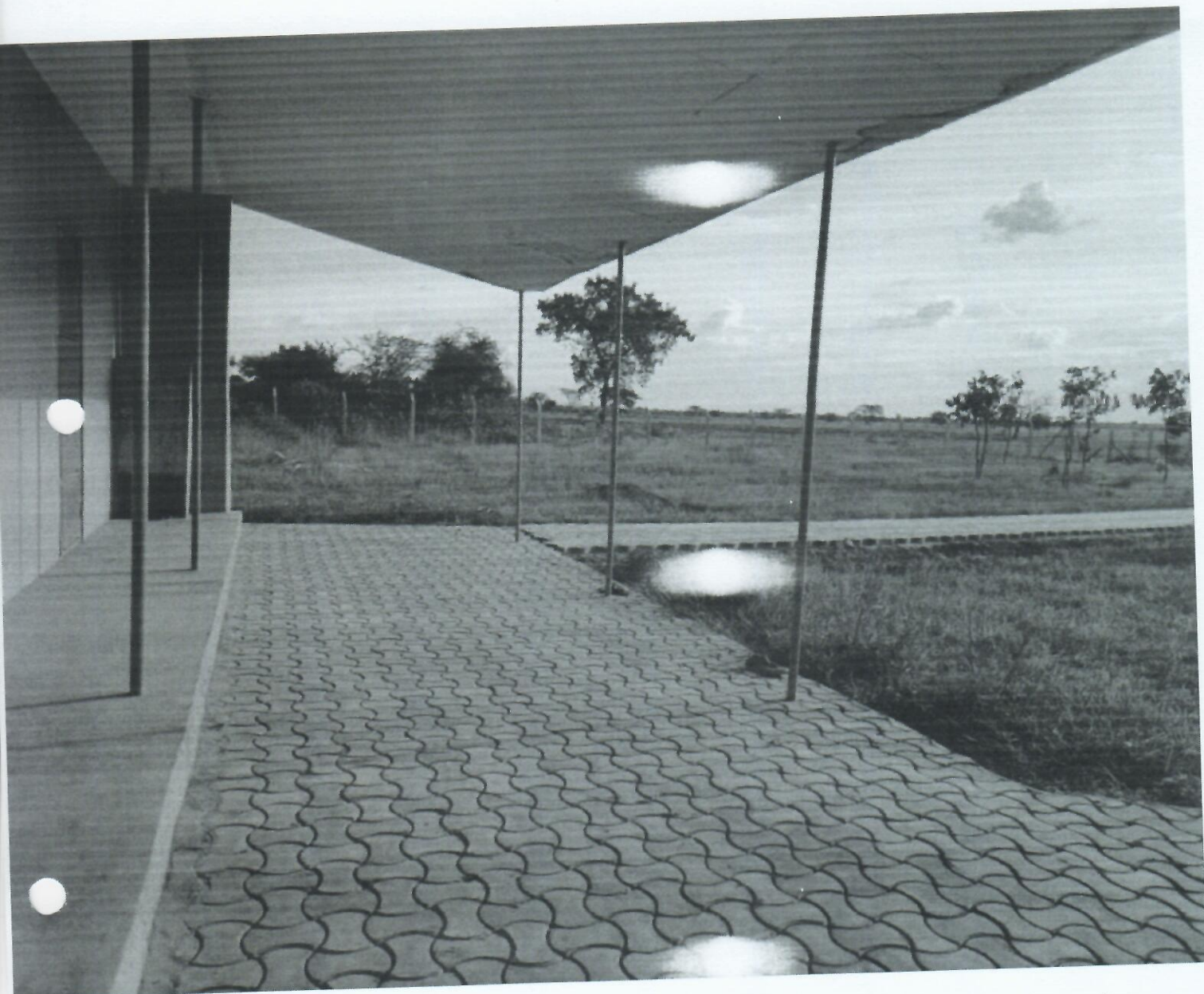
2. Construction of Administrative building at the site