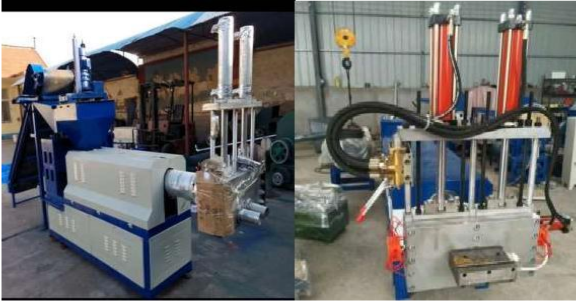
Figure 3; Proposed machine to be used