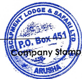
Company Stamp/ Seal