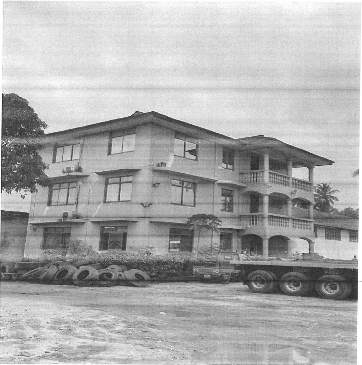
Office building for the project