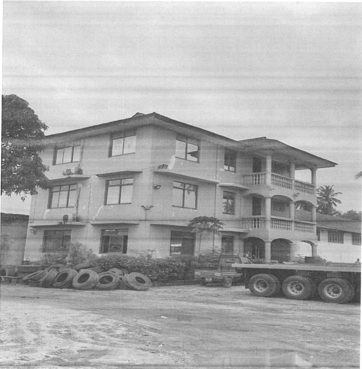
Office building for the project