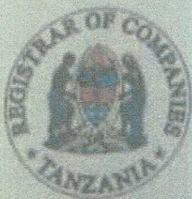
Princ. Asst. Registrar of Companies

GIVEN under my hand at Dar es Salaam this 20 th day of MAY TWO THOUSAND AND EIGHTEEN.