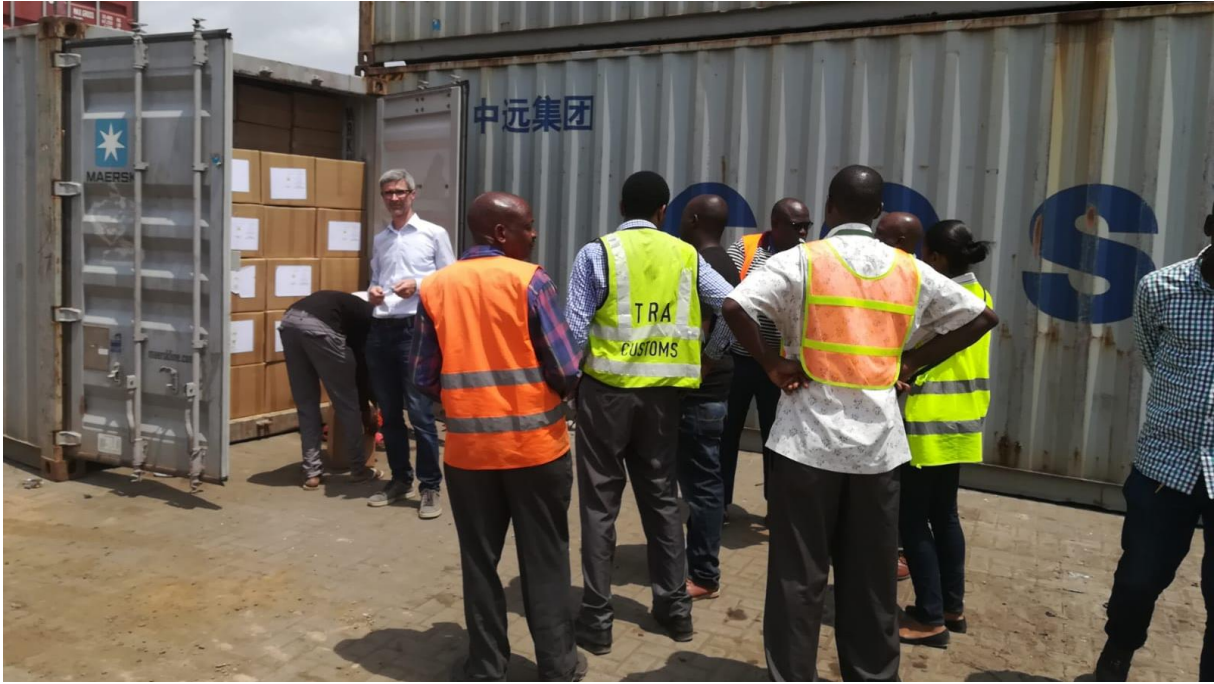
Container export and inspection through authorities in the port of Dar es Salaam