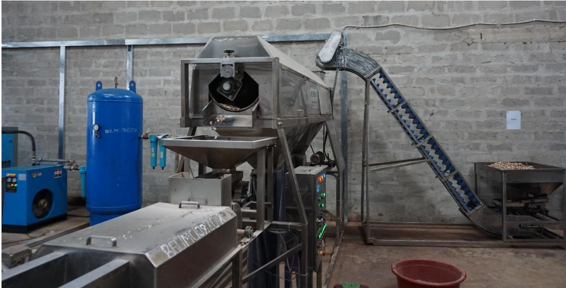
BIOTAN Organic Cashew Nut Factory, peeling section