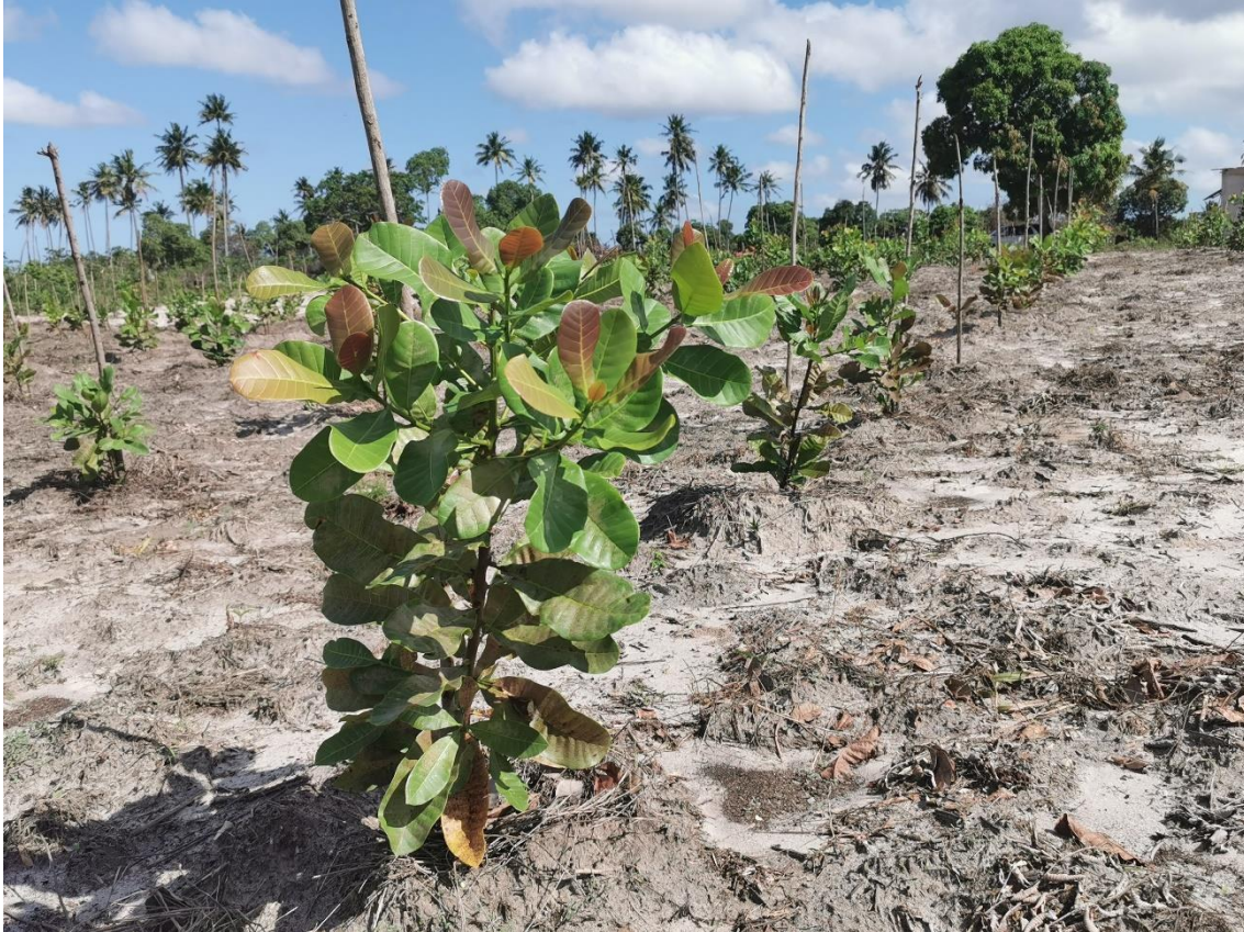
Demo farm, ultra-high-density plantation of new cashew varieties

BIOTAN is continuously expanding the Organic Grower Group and in 2021 BIOTAN started to register farmers in Tanga region/Mkinga district. Volumes can be scaled up by increasing the yields of existing contract farmers. This can be achieved by providing training and showing best practice at our demo farm. This includes plantation of new varieties, sophisticated organic farming practices and biological management of pests.