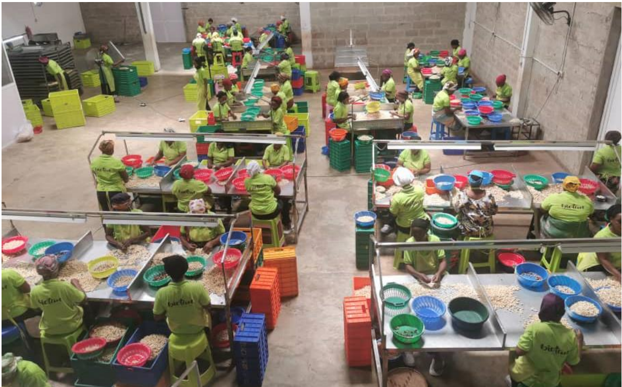
BIOTAN Organic Cashew Nut Factory, sorting and grading section