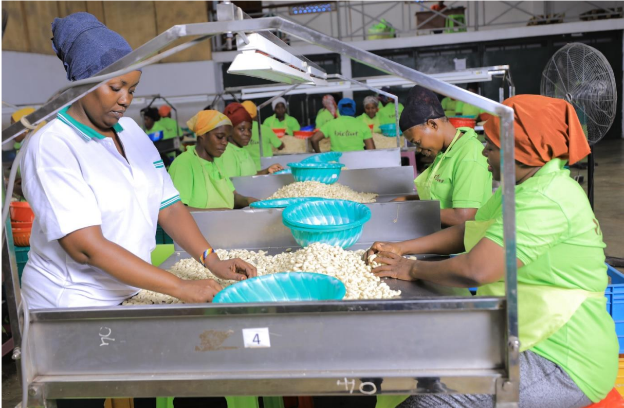
BIOTAN Organic Cashew Nut Factory, Grading section