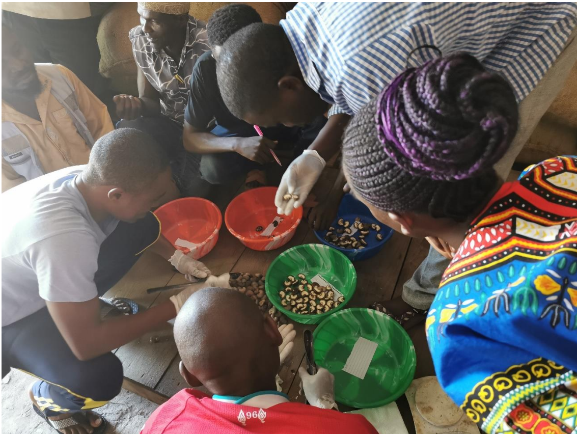
Collection of organic raw cashew nuts and quality assessment through cutting test