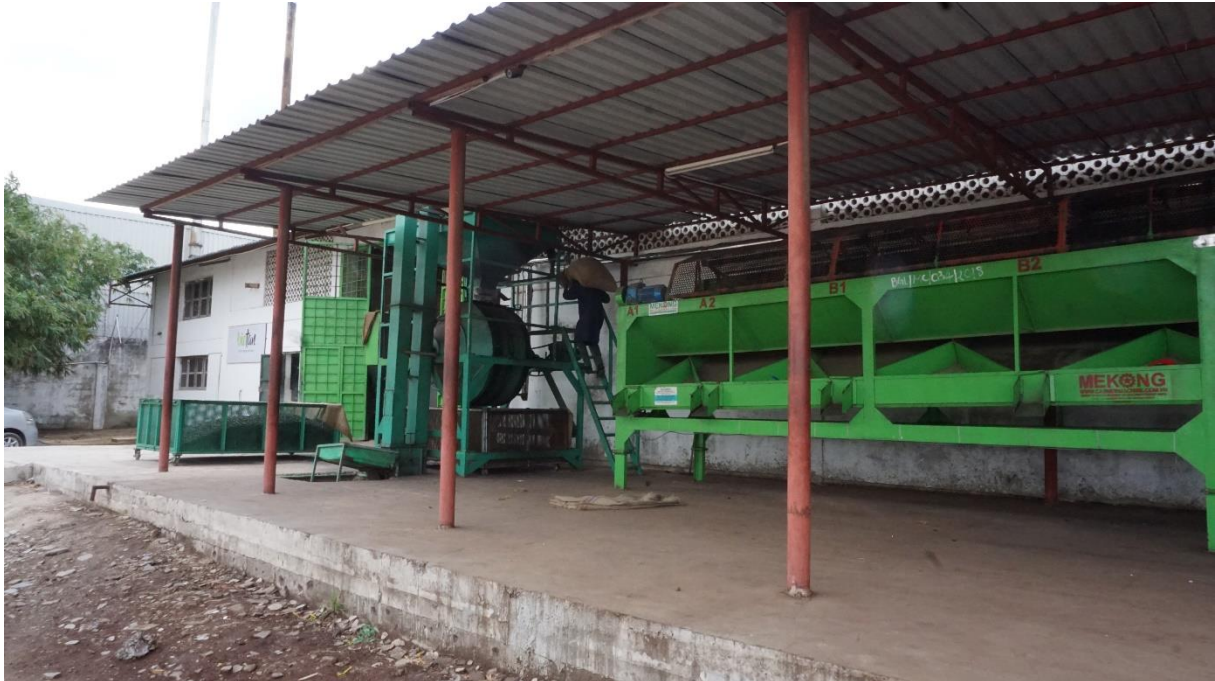
BIOTAN Factory and Warehouse, Mbagala Industrial Area

BIOTAN has established a factory for processing organic cashew nuts including storage of the raw material and packing of the high-grade end product. The production capacity of the factory is around 7 tonnes of RCN per day which leads to an output of 1.47 tonnes of cashew nuts ready for shipping per day and around 35 tonnes per month. Export and shipping are done via Dar es Salaam.