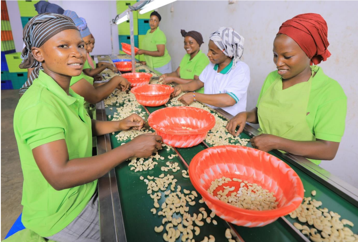
BIOTAN Organic Cashew Nut Factory, sorting and grading section