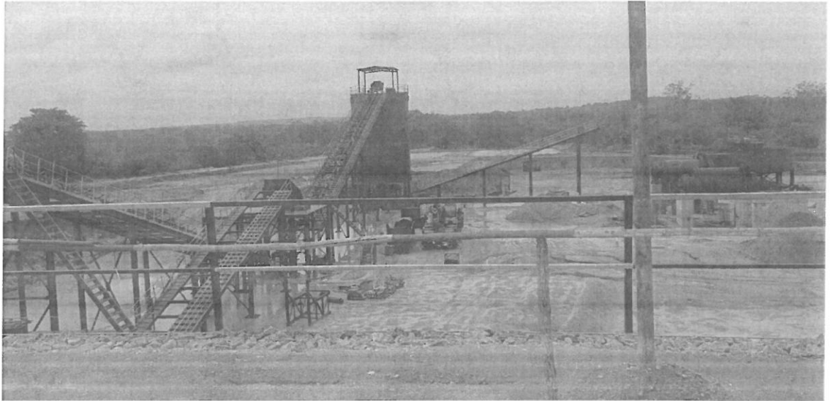
Pic 1. Crusher plant under construction