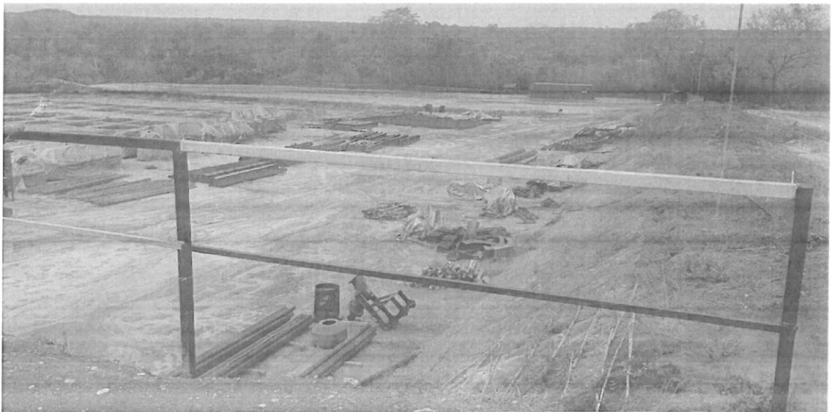
Pic 2. Processing machines waiting for assembly