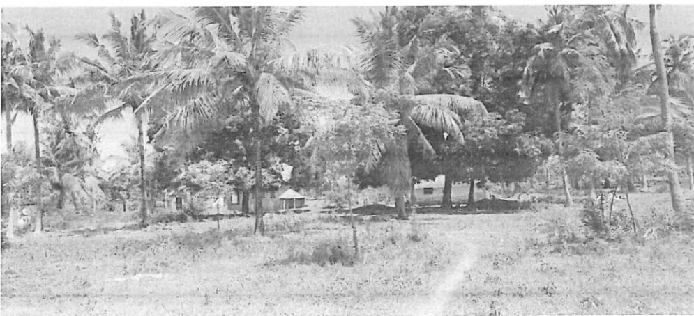
Plate 3: Some trees and houses in the proposed project site