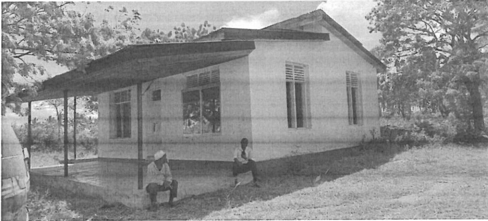
Plate 2: one of houses existing in the plot