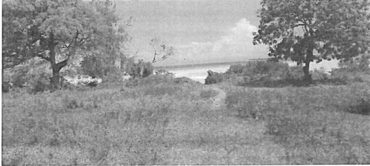
Plate 1: Bushy site at the beach side of the plot