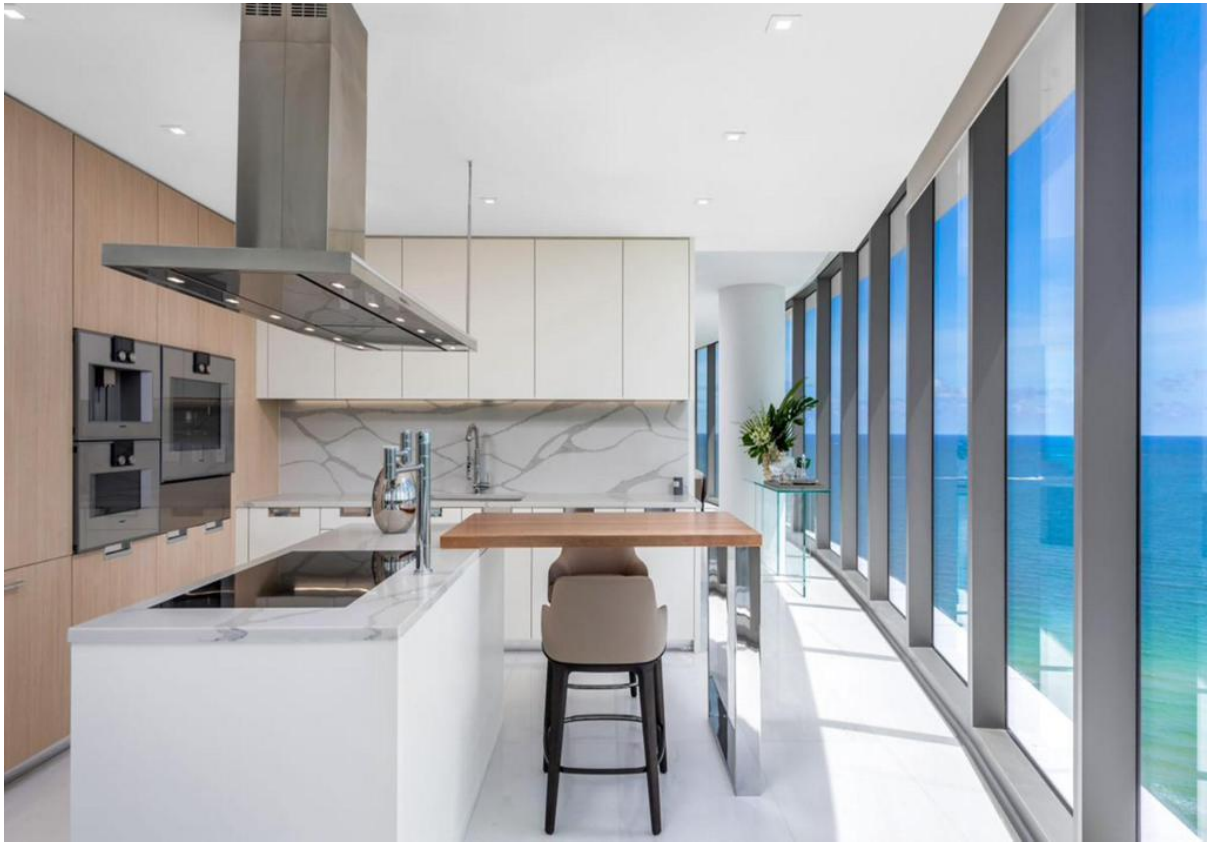
Presidential Suite Kitchen

A Fully Equipped Kitchenette with Built in Oven, Microwave and Espresso machine. All Appliances, Sanitary ware and Faucets will be of A-Grade International Standard.