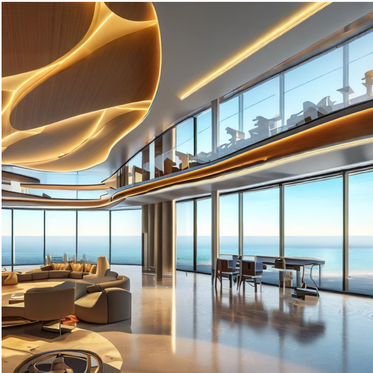
Lobby of the Hotel

A Total of 3 Exclusive and Exquisite Floors will be dedicated to World Class Presidential Suites and Grand Royal Suites. The Main Hotel Lobby, strategically placed, right at the brim to face the magnificent views of the Indian Ocean. Double Height Floor to Ceiling Height Tilt Glasses provide seamless views of the nature. The Hotel will host one-of-a-kind Finest and Exclusive Sea Facing Restaurant. A Contemporary Ultra Modern Business Lounge and Bar will also be one of the many Super Amenities of the Hotel.