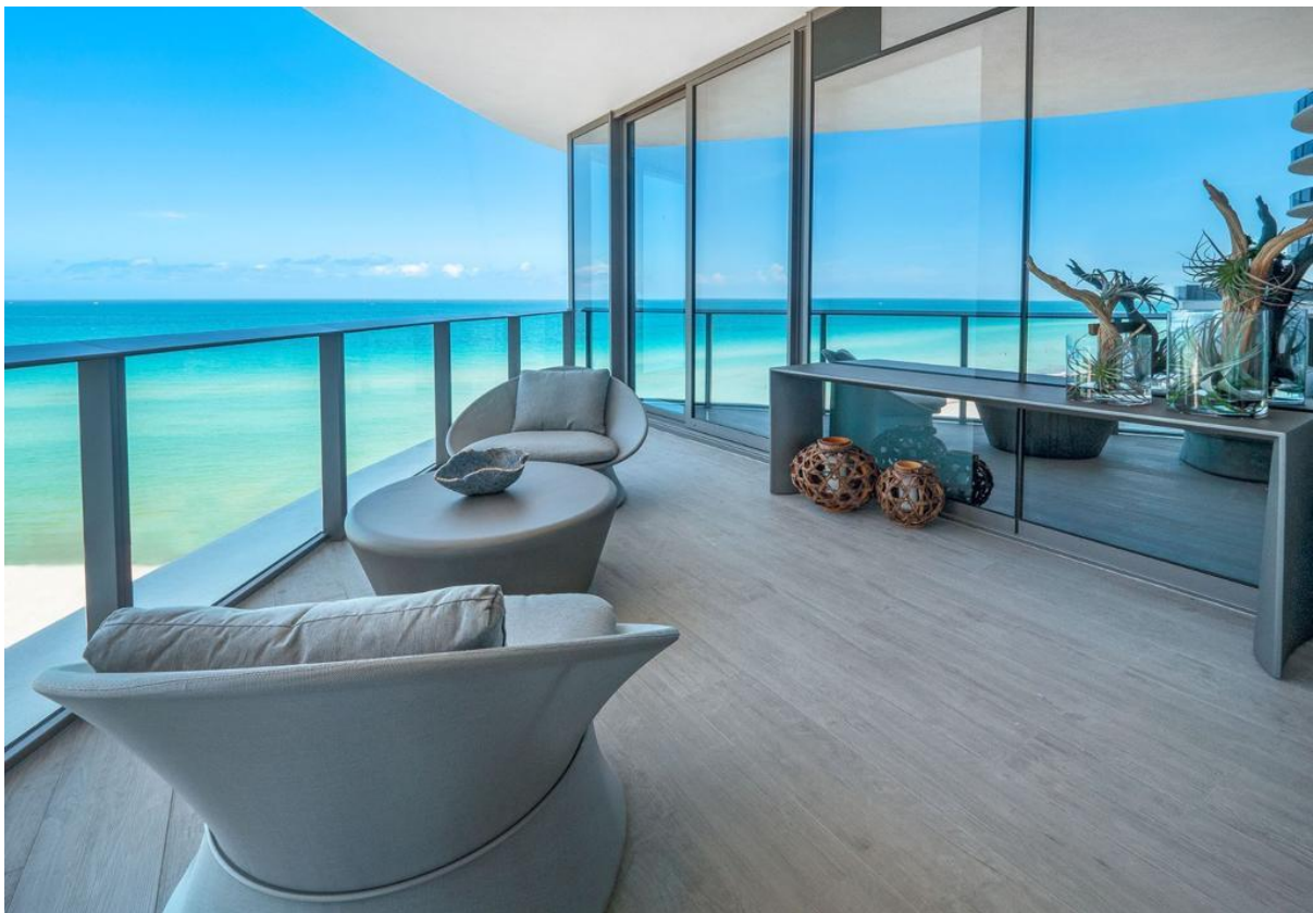
Upper Floor Balcony of Presidential Suite overlooking the Indian Ocean

A Fully Equipped Kitchenette with Built in Oven, Microwave and Espresso machine. All Appliances, Sanitary ware and Faucets will be of A-Grade International Standard.