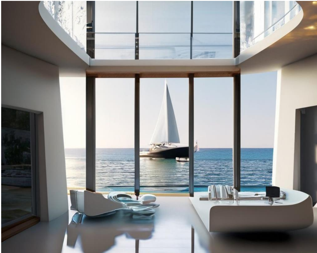
Lobby Corner with Yacht Docking