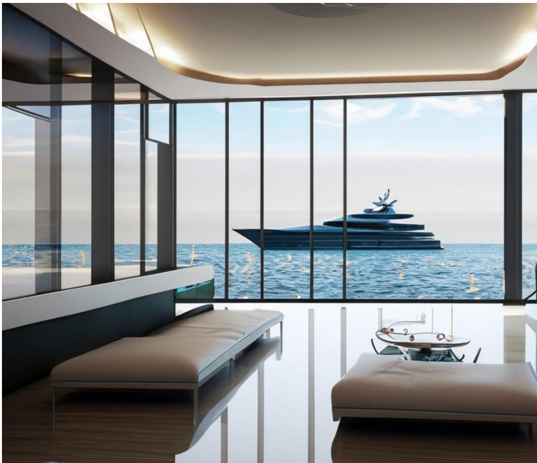
Small Lounge corner with Coffee area from Lobby with Entire View of Dar es salaam