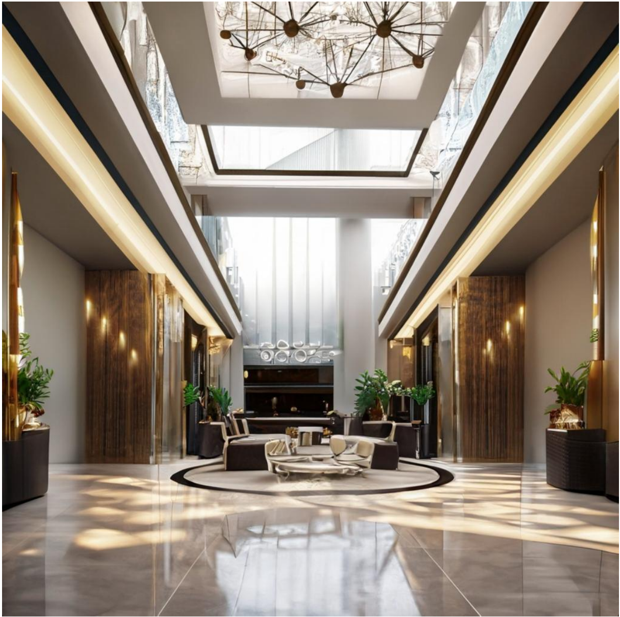
Main Hotel Lobby View.

The Grand Main Hotel Lobby View featuring Rich and Modern Interior with Handpicked and Hand polished Exclusive Marble flooring.