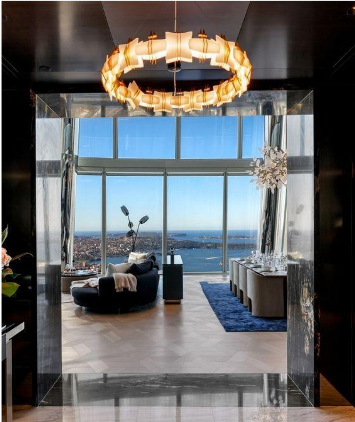
The Grand Royal Suite

Each 180 Sqm Grand Royal Suite will feature a Huge Living room and Dining area complete with High End wall and Polished Marble Finishes. A Fully Equipped kitchenette and his-and-hers Italian marble baths with whirlpool tub and glass enclosed shower. A King Size bed with Luxurious in-house feature on the same floor.