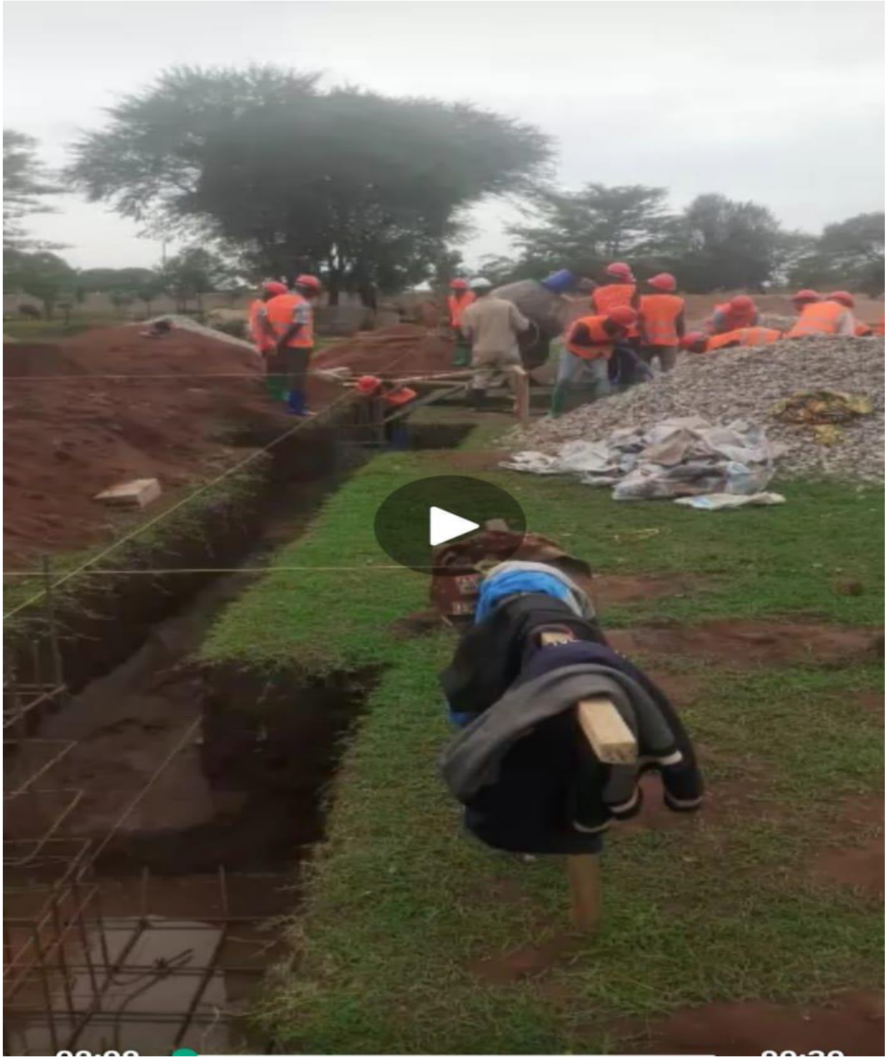
Figure 3: Godown foundation