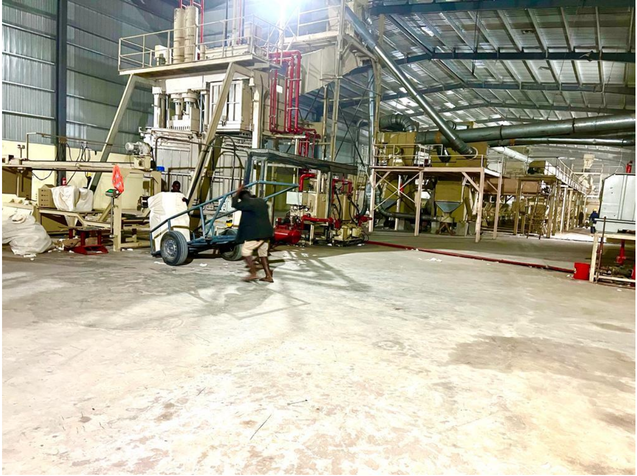
Figure 2: Front view