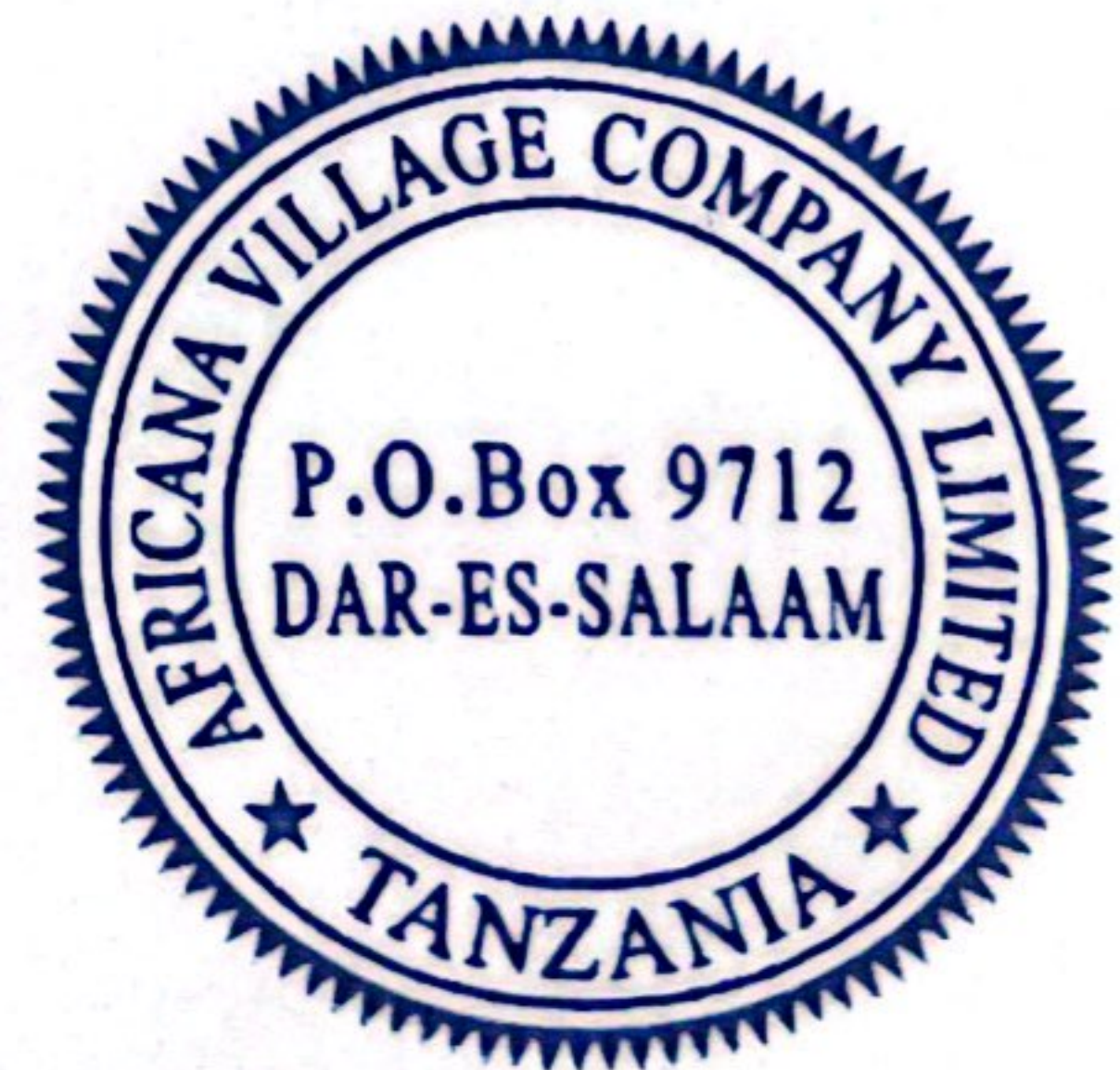
Managing Director AFRICANA VILLAGE COMPANY LTD