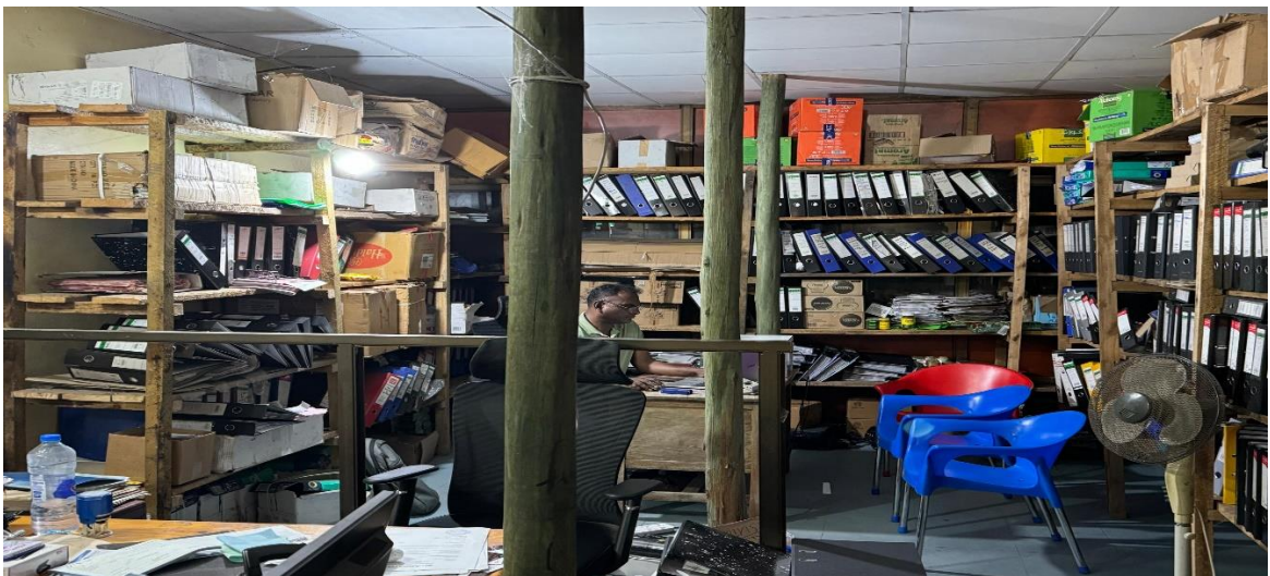
The company office in Dar es Salaam, Tanzania