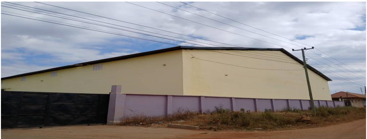
The company's office in Ruvuma Region