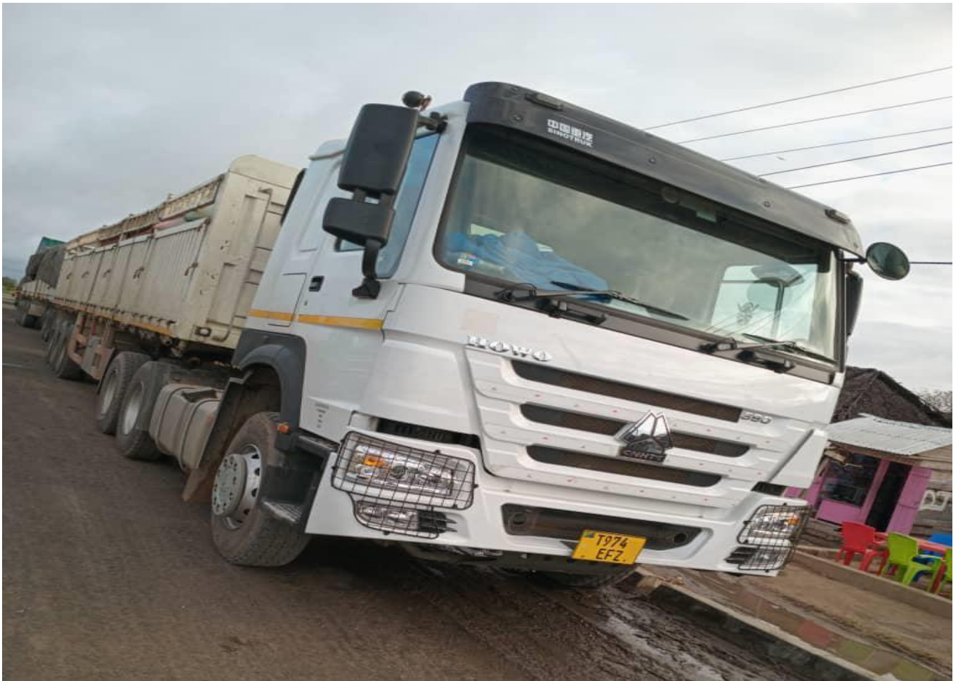
The company truck at Tunduma Border in Tanzania

The mentioned countries depends on Tanzania port for handling fuel and other cargo which is transported by road to respective countries, in order to link these countries that AL-AZIZIA (T) LIMITED has resolved to invest in the fuel and cargo transport industry so as to provide a solution that would lead to stimulating the said intraregional trade. The project is expected to offer a challenge to the business community to enhance intraregional trade between Tanzania and these countries.