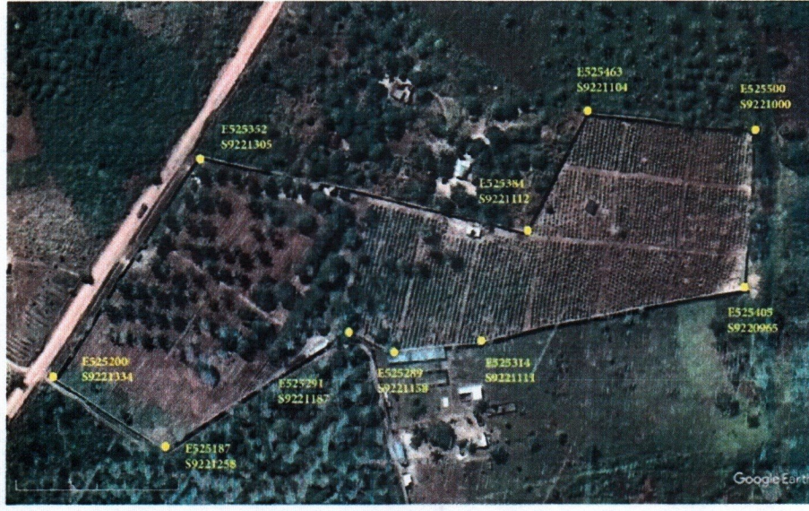
Mwanambaya – Kisemvule Plot