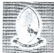
Chief Academic Officer