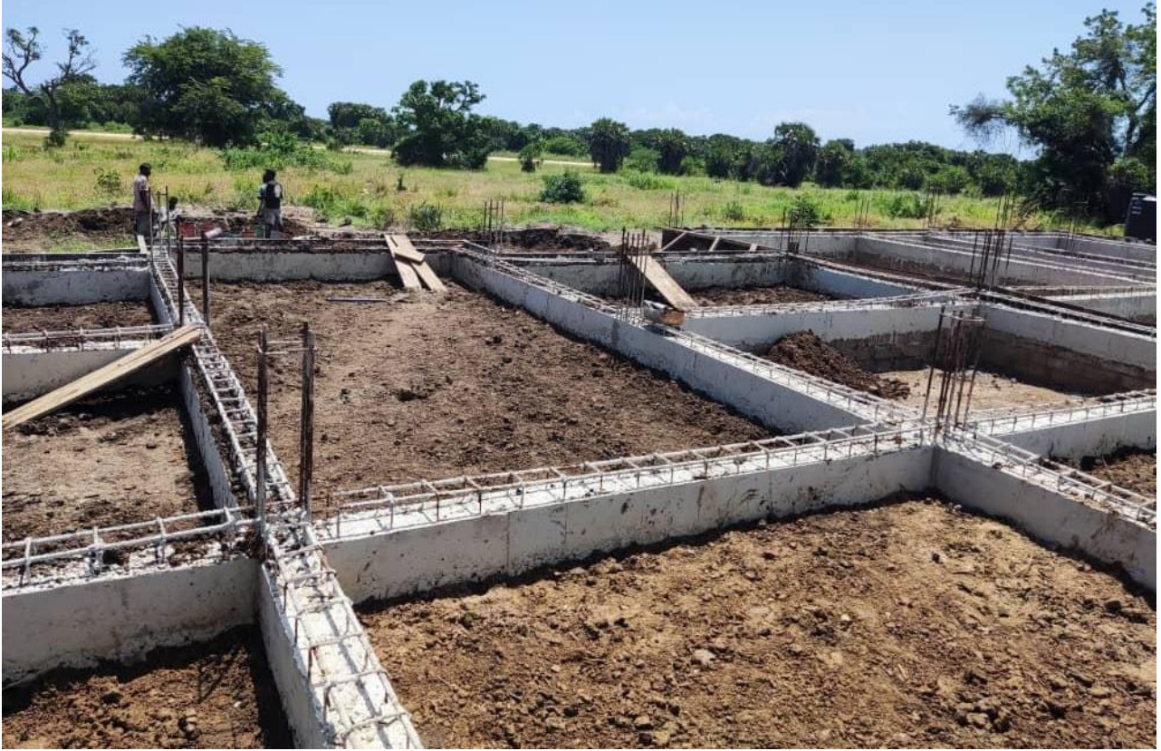
Figure 6. This picture shows the partially built pillars for the north wing in the foreground, and the west wing is in the background.