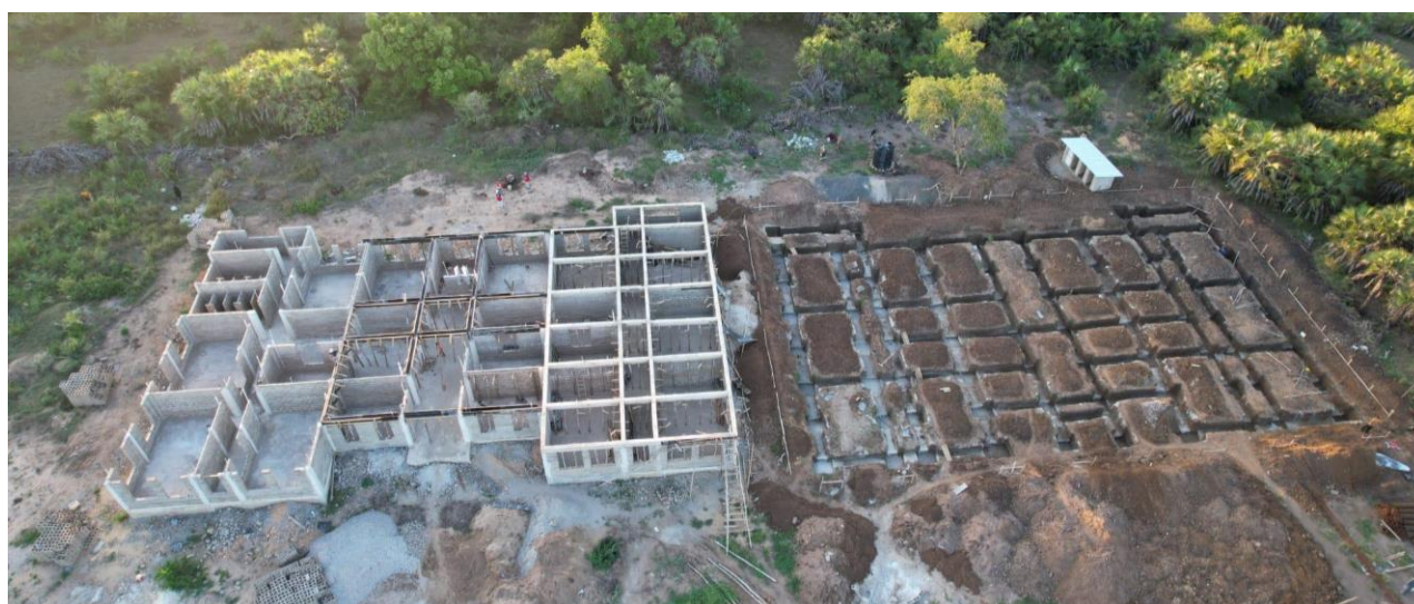
Figure 5. Another view of the west wing of the school.