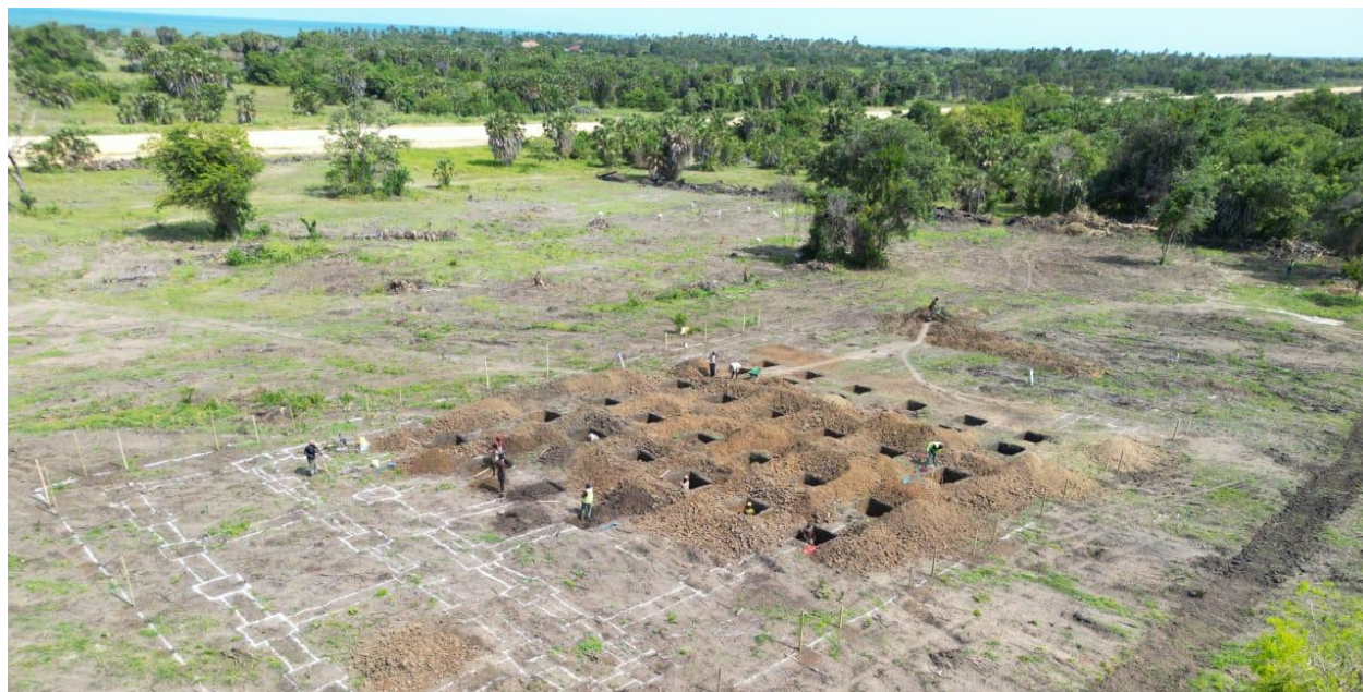
Figure 4. A partial view of the west wing of the school under construction. The school building starts at the northwest corner of the land.

Appendix B. The figures in the balance sheet are in shillings. Currently, construction is fast approaching its rough finish. The pictures below in Figures 4 to 6 show a partial view of the school under construction. Figures 4 and 5 show the west side classrooms. Figure 6 shows the foundation and pillars for the north wing (in the foreground) of the building while the west wing is in the background.