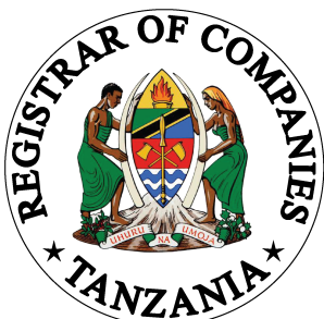
Princ. Asst. Registrar of Companies

NOTE. Information printed from the Register of Company is true and complete as per extract generation date and time. Please be advised to refer to the Online Registration System at BRELA (ors.brela.go.tz) for an up-to-date information regarding given Company.